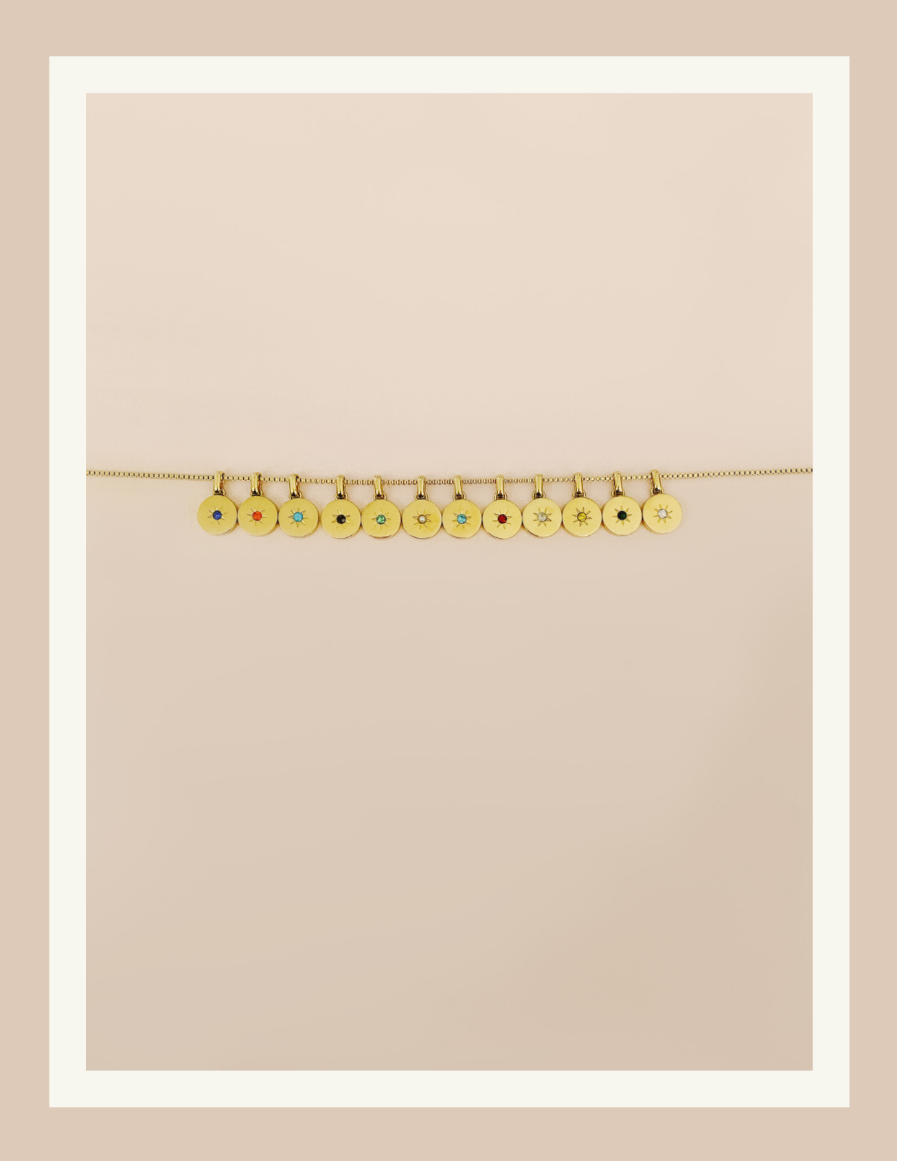
YOU'RE A REAL GEM

SUGAR BLOSSOM JEWELRY | HOLIDAY GIFT GUIDE 2019