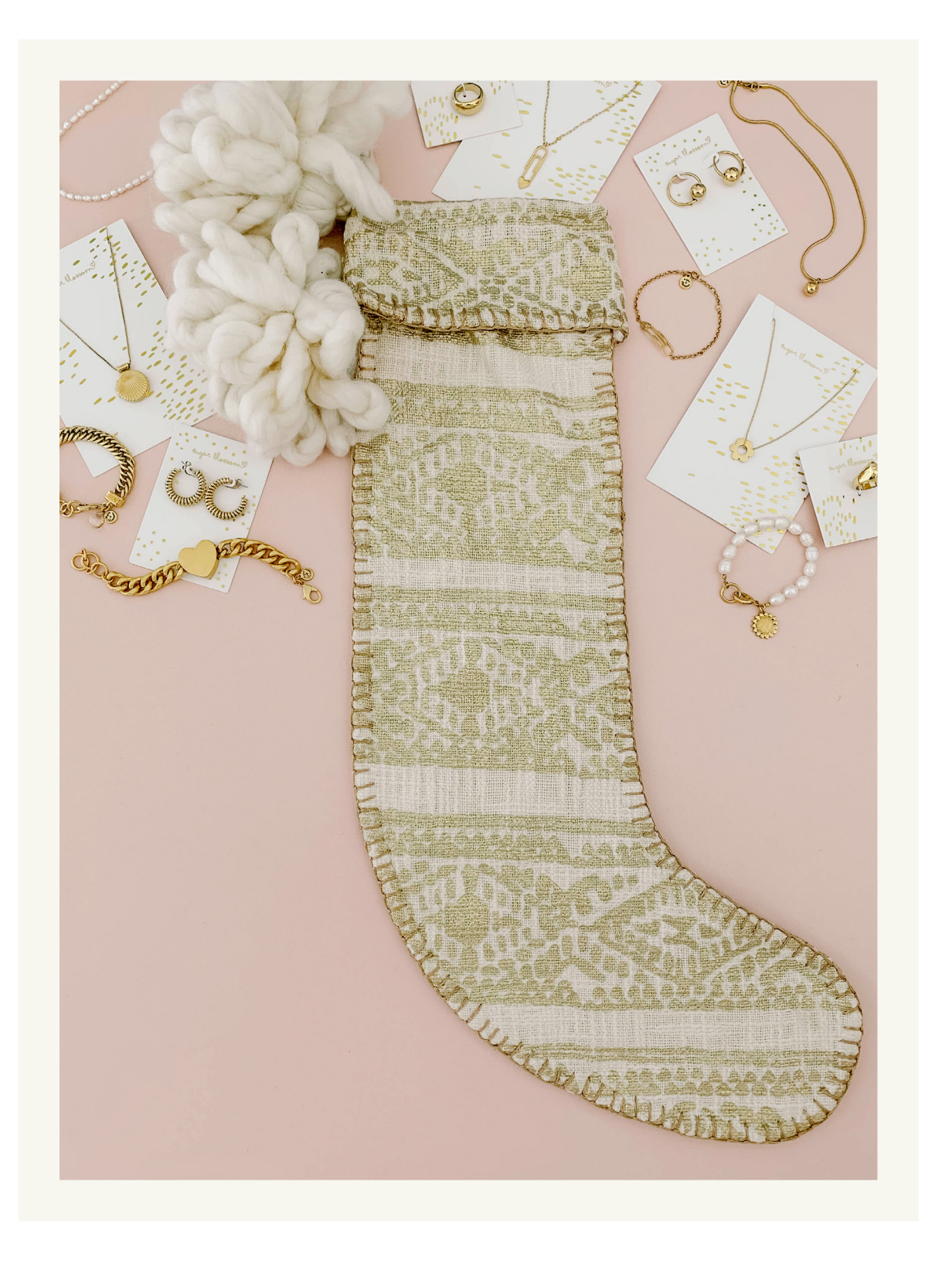
A STOCKING FULL OF SHINE