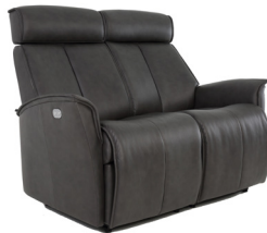
VENICE POWER RELAXER WS 2 SEAT