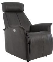
VENICE POWER RELAXER WS 1 SEAT