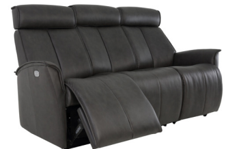
VENICE POWER RELAXER WS 3 SEAT