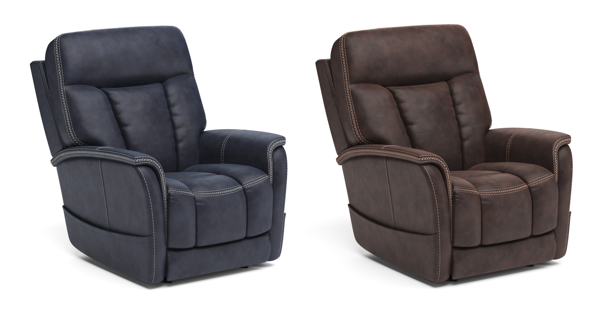
FLEXSTEEL® Fabric | Latitudes Motion