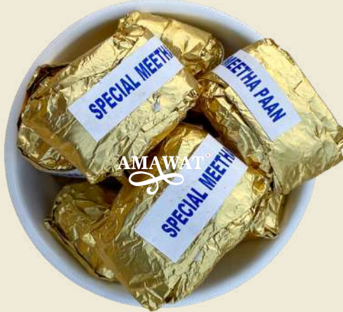
Special Meetha Paan