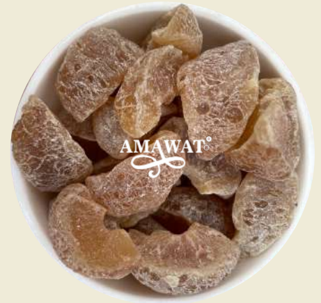
Amawat Amla Candy