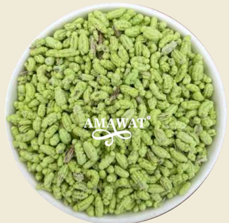
Light Green Madrasi Saunf