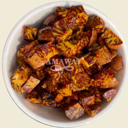
52 No. Supari

Scented supari, also known as flavored betel nuts or flavored paan, is a popular cultural and traditional treat enjoyed in various parts of South Asia. One of the key reasons for the popularity of scented supari is its ability to freshen the breath and provide a pleasant aftertaste