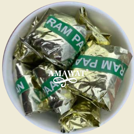
Ram Paan Golden