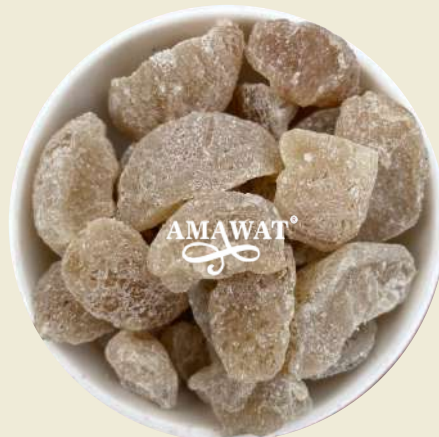
Silver Sweet Amla