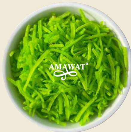
Green Gola Laccha