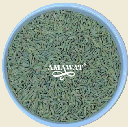
Scented Sweet Saunf