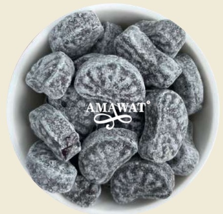
Kala Khatta Candy