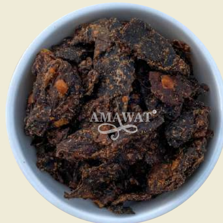
Nasik Paan Red