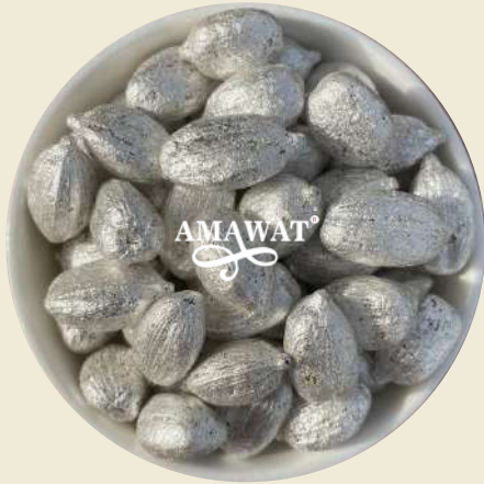
Silver Elaichi XXL

Silver-coated mukhwas—an enchanting fusion of tradition, flavor, and elegance. Mukhwas, a colorful assortment of savory or sweet mouth fresheners, has been an integral part of Indian culture for centuries. The addition of silver coating to these tiny edible treats adds an extra touch of visual appeal and sophistication, elevating the mukhwas experience to a new level.