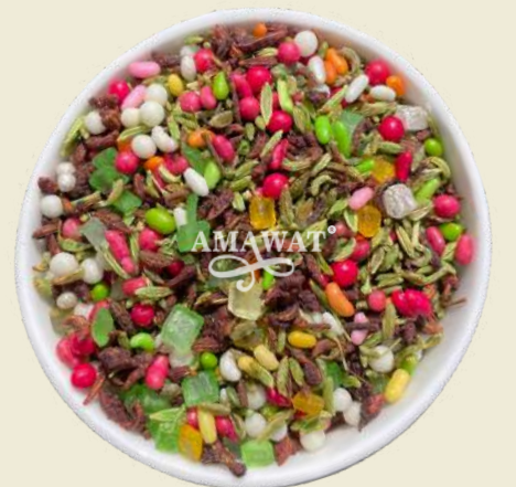
Punjabi Mix Mukhwas II