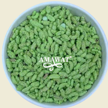
Green Madarsi Saunf