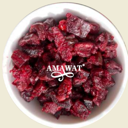
Special Red Chuara