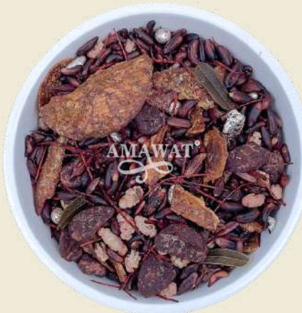
Bombay Mixture (supari)