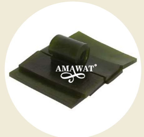
Kaccha Aam Papad