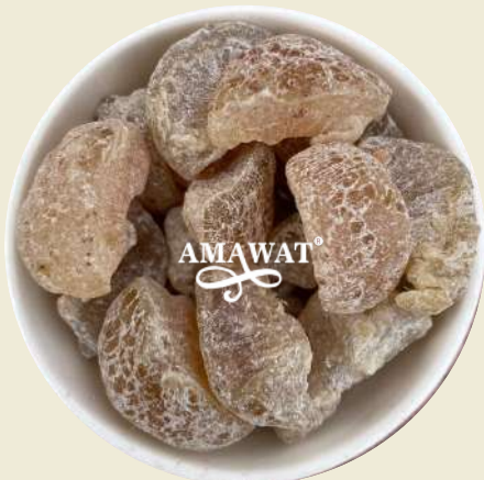
Gold Sweet Amla