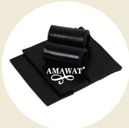
Kala Khatta Aam Papad