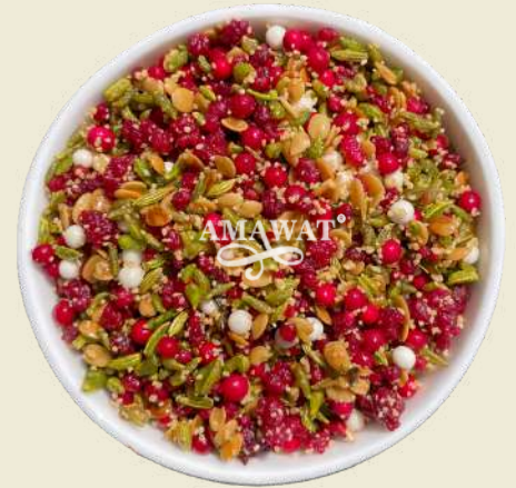
Khus Khus Mixture