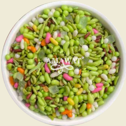
Garden Mukhwas II