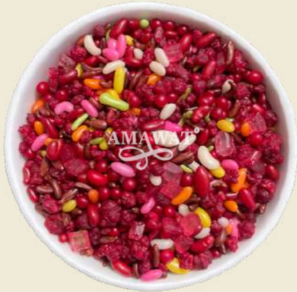
Gulab Mukhwas (Bunty Mukhwas)

Mukhwas is a traditional Indian mouth freshener that is commonly consumed after meals. It is a mix of various ingredients such as fennel seeds, anise seeds, sesame seeds, coconut, and sugar, among others. Mukhwas not only freshens the breath but also aids in digestion, making it a popular post-meal ritual in Indian culture.