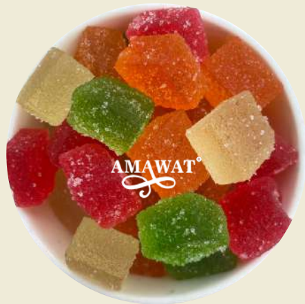
Mix fruit Jelly Cube 1st