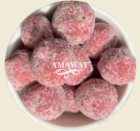
Imli Ladoo With Seeds