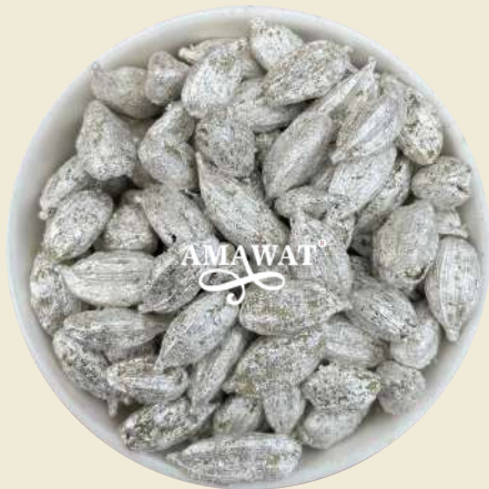
Silver Elaichi Special