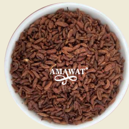
Churi Saunf 2nd