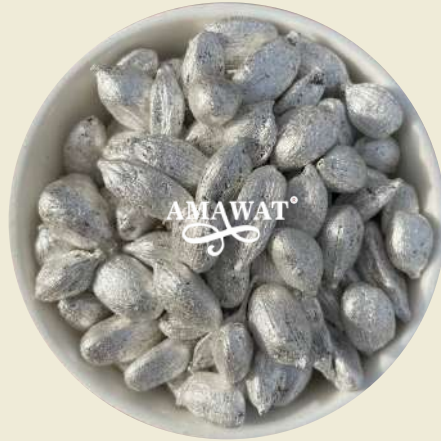
Silver Elaichi Small Barik vali