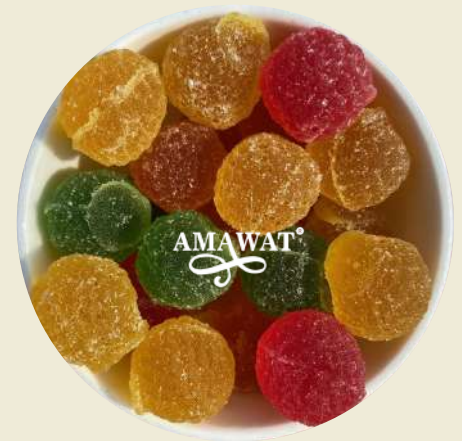
Mix Fruit Jelly Round