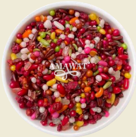
Chandan Mix II

Mukhwass is a traditional Indian mouth freshener that is commonly consumed after meals. It is a mix of various ingredients such as fennel seeds, anise seeds, sesame seeds, coconut, and sugar, among others. Mukhwass not only freshens the breath but also aids in digestion, making it a popular post-meal ritual in Indian culture.