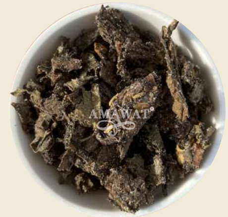
Nasik Paan Green