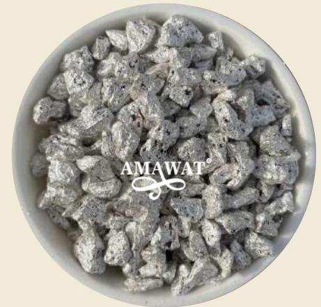
Silver Gulab Supari