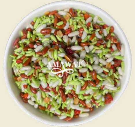
Chocolate Mukhwas II