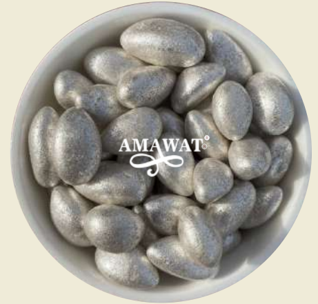
Silver Sweet Elaichi