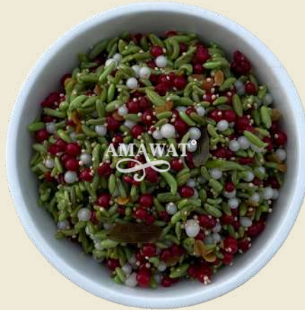
Khus Mix Green