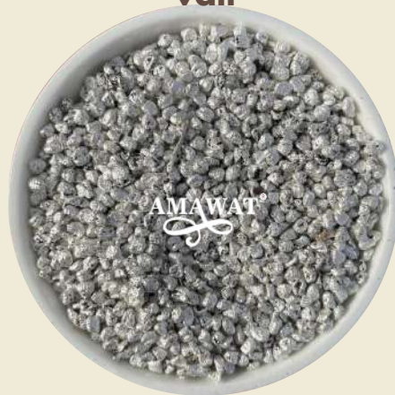
Silver Elaichi Dana 2nd