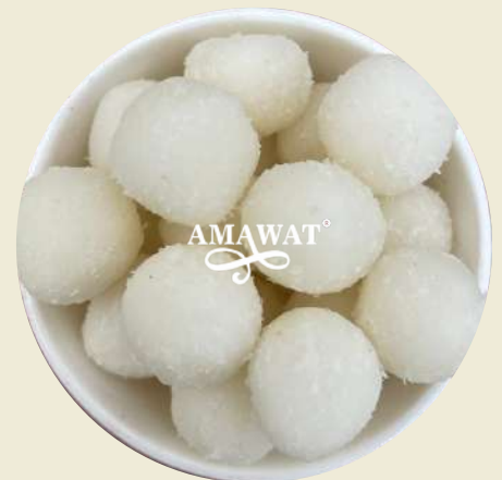
Gola Round Peda