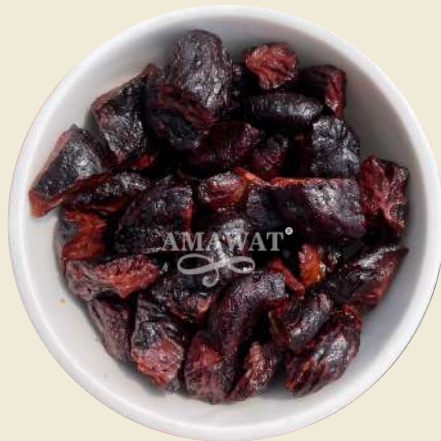
Chikni Bombay Meethi/Fiki