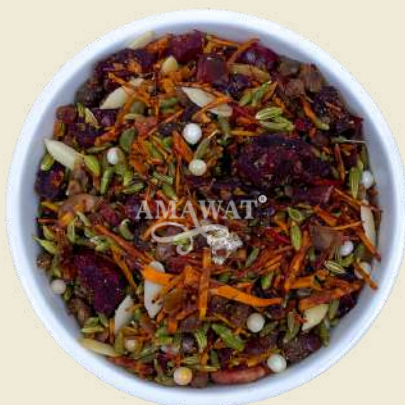
Export-1 Mix(Supari Mukhwass)