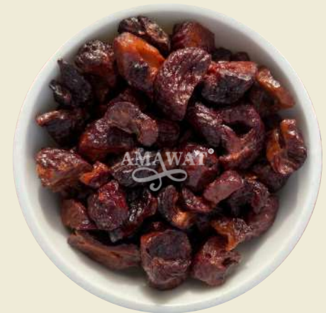
Chikni Assam Meethi