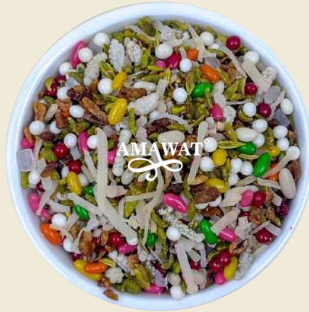
White Coconut Mukhwass