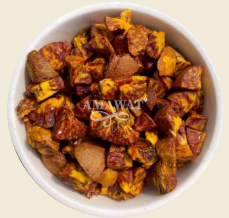
Half Work Supari