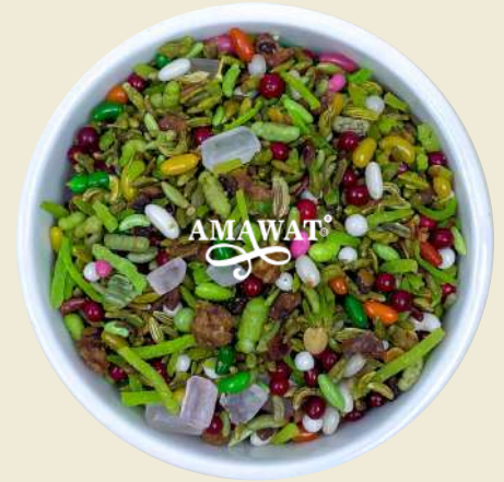
Green Coconut Mukhwass