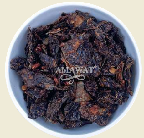
Dry Red Green Paan