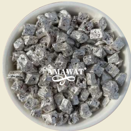
Silver Cherry (Rasili)