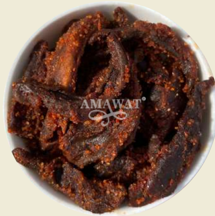
Mirchi Aam Papad