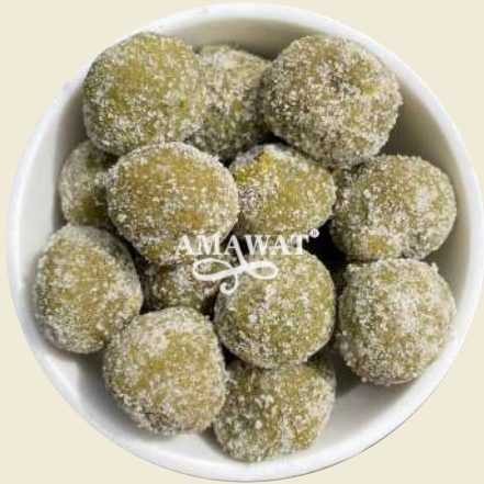
Kaccha Aam Kerry

Digestive items are not only beneficial for promoting gut health and aiding in digestion, but they also make for a delicious and satisfying snack for people of all ages. With their chatpata savory taste and multiple health benefits, they are a popular and versatile snack choice that can be enjoyed at any time of day.