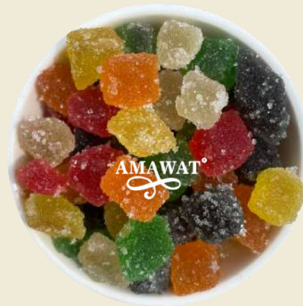
Mix Fruit Jelly Cube 2nd