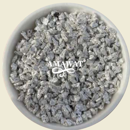
Silver Khus Supari

Silver-coated mukhwas—an enchanting fusion of tradition, flavor, and elegance. Mukhwas, a colorful assortment of savory or sweet mouth fresheners, has been an integral part of Indian culture for centuries. The addition of silver coating to these tiny edible treats adds an extra touch of visual appeal and sophistication, elevating the mukhwas experience to a new level.