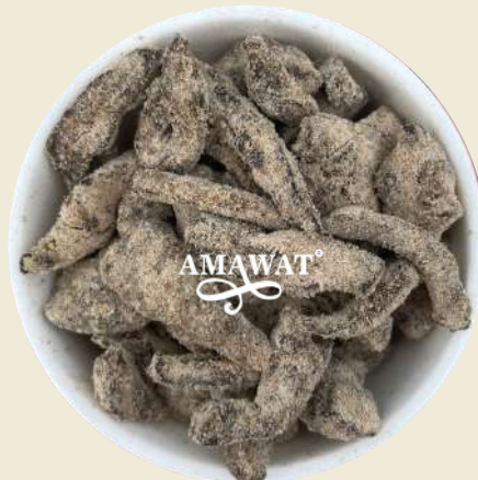
Khatta Aam Papad