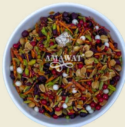
Kesar Mixture (Dhanadal)