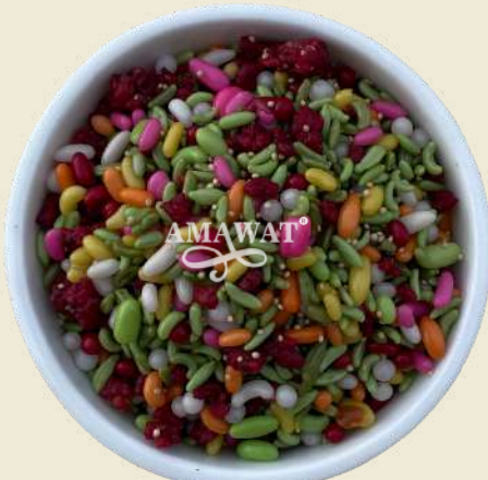
Satrangee Mukhwas II