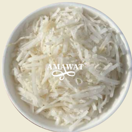
White Gola Laccha