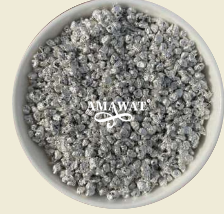
Silver Elaichi Dana 1st