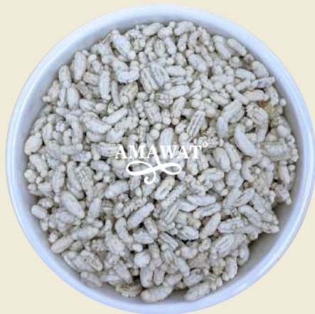
White Madrasi spl

Saunfs is a type of mouth freshener popularly consumed after meals in India. It is made by roasting fennel seeds and adding other ingredients such as sugar, spices, and flavors.