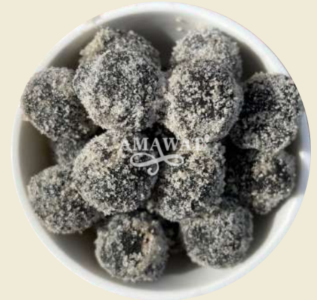
Kala Khatta Peda