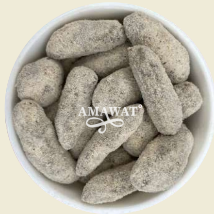
Khatta Meetha Chuara