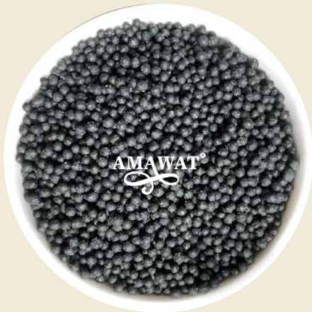
Kali Heeng Dana