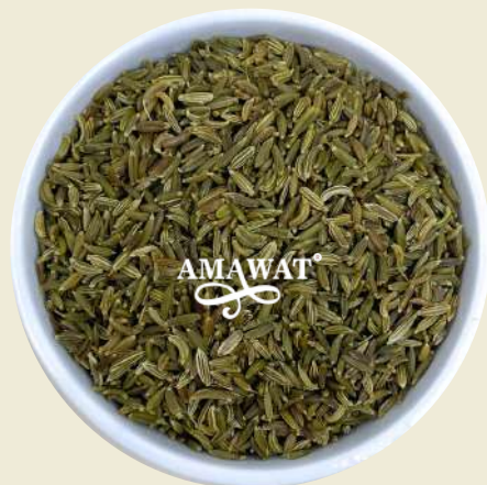
Scented Gili Saunf