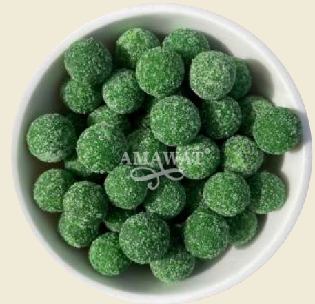
Kaccha Aam Goli