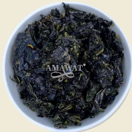
Dry Paan Leaves