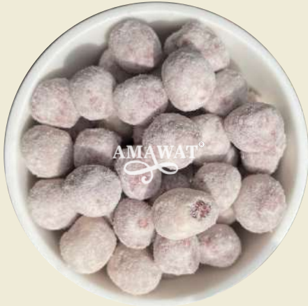
Small JP Ram Ladoo

Digestive items are not only beneficial for promoting gut health and aiding in digestion, but they also make for a delicious and satisfying snack for people of all ages. With their chatpata savory taste and multiple health benefits, they are a popular and versatile snack choice that can be enjoyed at any time of day.