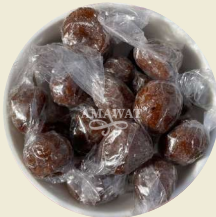
Manchali Imli Spl.