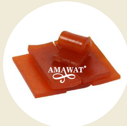
Alphonso Aam Papad