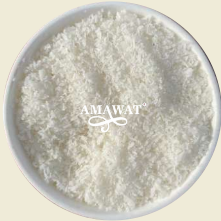
White Gola Burada

Mukhwass is a traditional Indian mouth freshener that is commonly consumed after meals. It is a mix of various ingredients such as fennel seeds, anise seeds, sesame seeds, coconut, and sugar, among others. Mukhwass not only freshens the breath but also aids in digestion, making it a popular post-meal ritual in Indian culture.