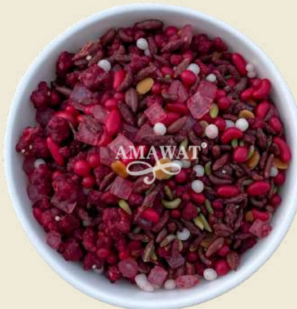
Kashmiri Mukhwas II