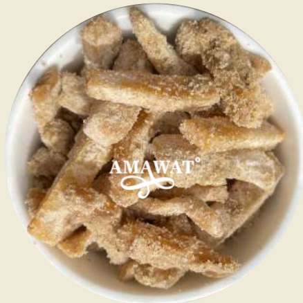
Khatta Meetha Aam Papad