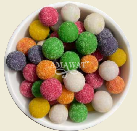
Kaccha Fruit Chat