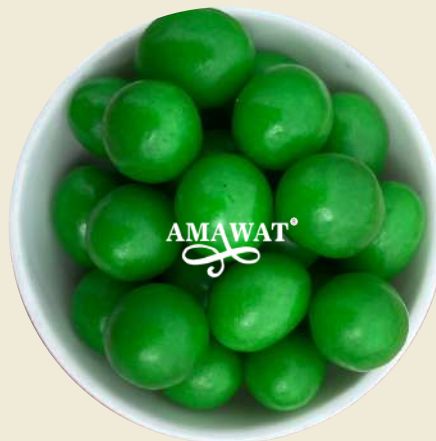
Kachcha Aam Shot