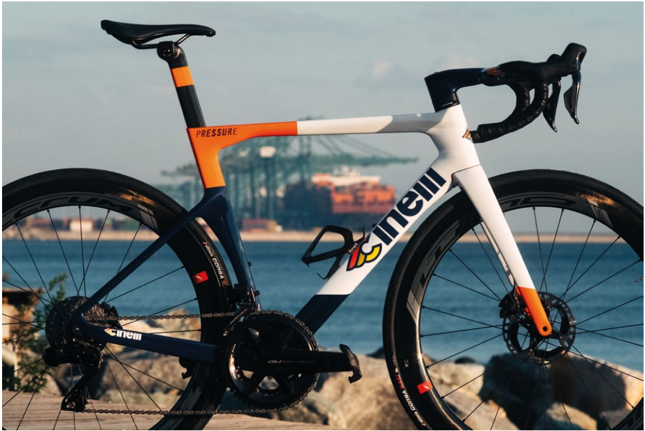
Vito rides the Pressure "Triple White"