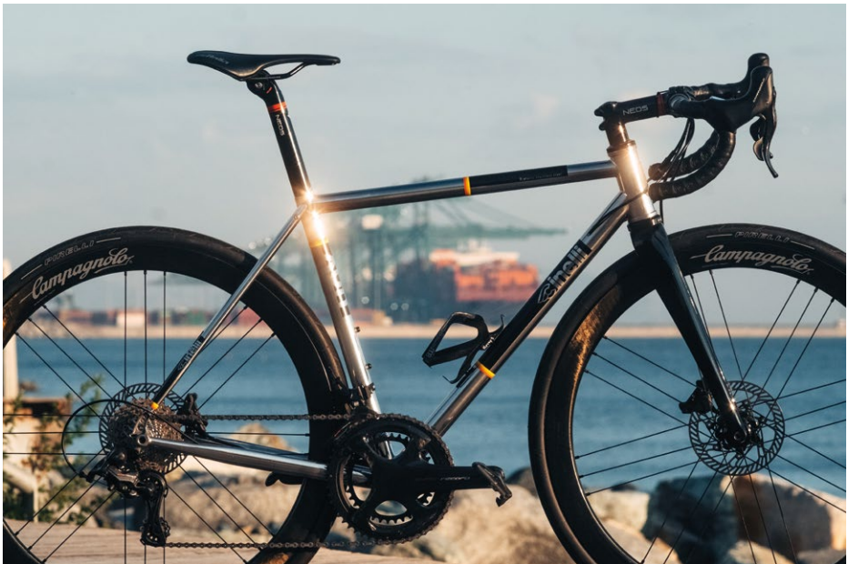
Daniele rides the XCR "Disc Mirror"