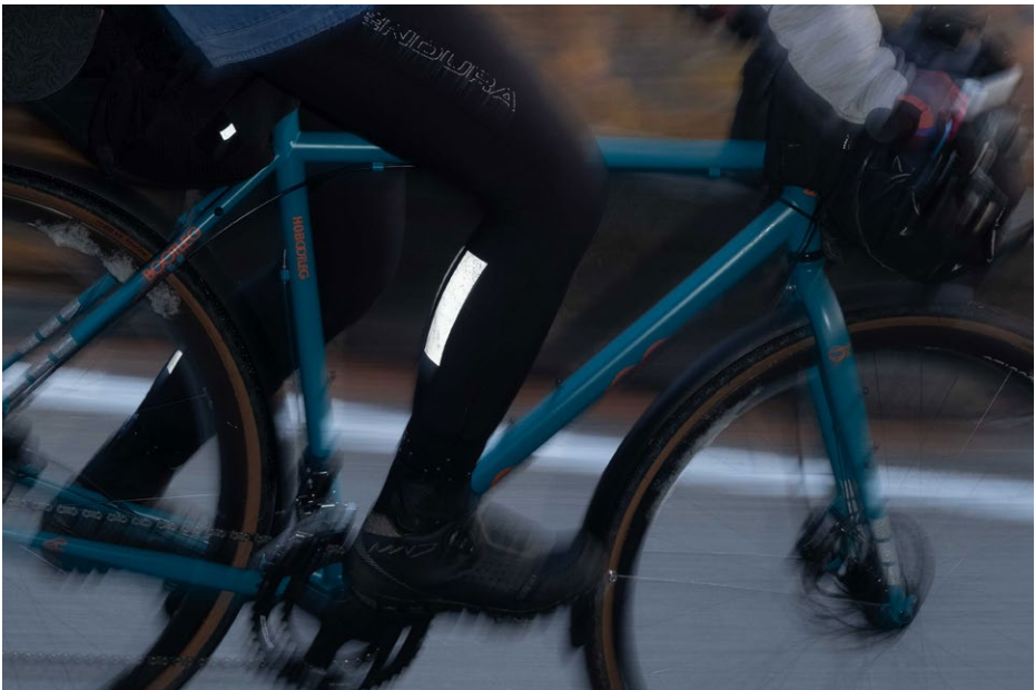
Clelia rides the 2023 Cinelli Hobootleg Interrail Emerald Pathway