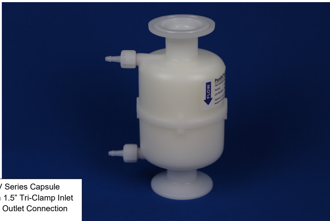
SZV Series Capsule with 1.5" Tri-Clamp Inlet and Outlet Connection