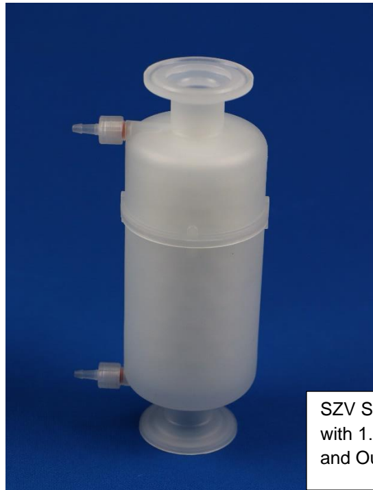
SZV Series Capsule with 1.5" Tri-Clamp Inlet and Outlet Connection