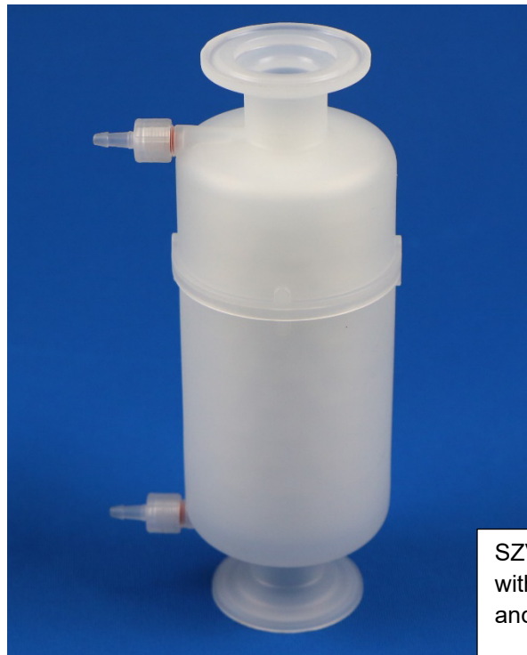
SZV Series Capsule with 1.5" Tri-Clamp Inlet and Outlet Connection