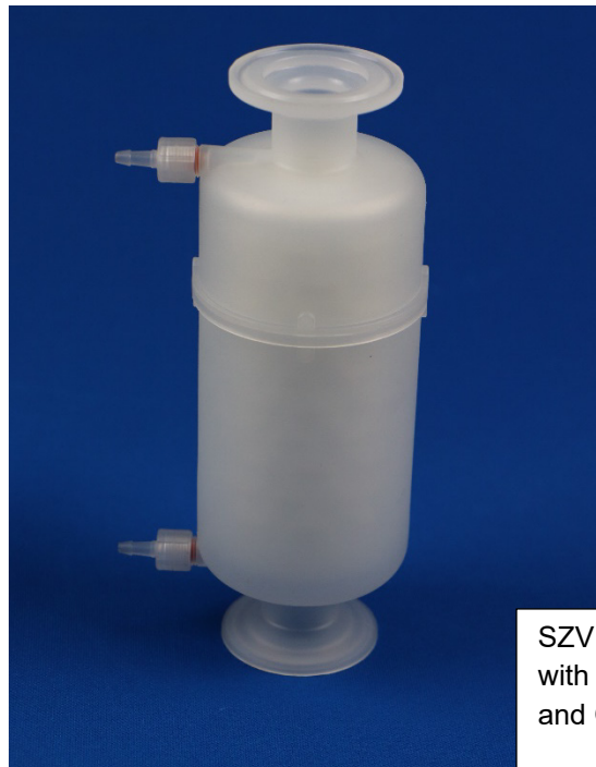
SZV Series Capsule with 1.5" Tri-Clamp Inlet and Outlet Connection