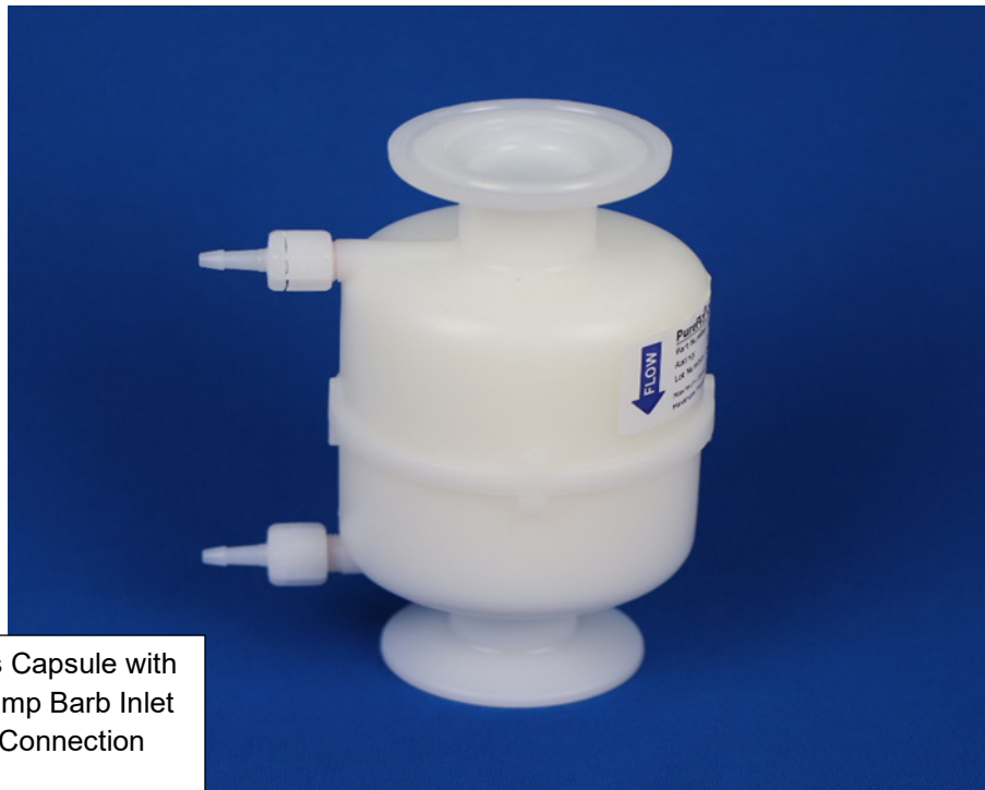
SZV Series Capsule with 1.5" Tri-Clamp Barb Inlet and Outlet Connection