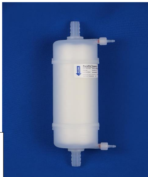
SKV Series Capsule with 1/2" Hose Barb Inlet and Outlet Connection

11070 Fleetwood St. Unit B, Sun Valley, CA 91352