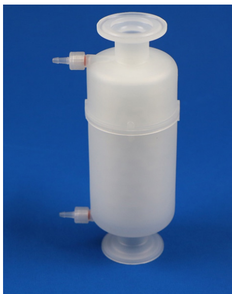
SKV Series Capsule with 1.5" Tri-Clamp Inlet and Outlet Connection