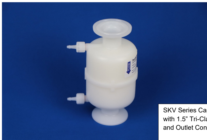
SKV Series Capsule with 1.5" Tri-Clamp Inlet and Outlet Connection