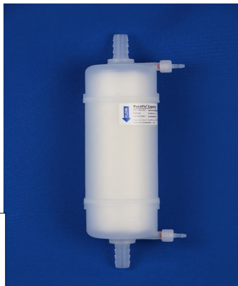
SKV Series Capsule with 1/2" Hose Barb Inlet and Outlet Connection