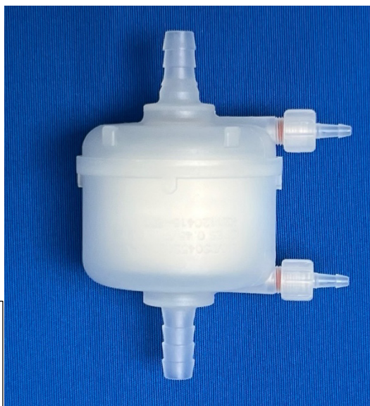
SKV Series Capsule with 3/8" Hose Barb Inlet and Outlet Connection