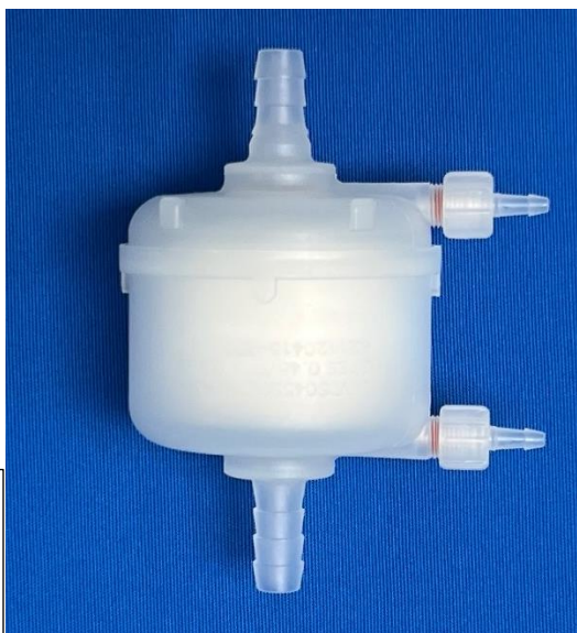
SKV Series Capsule with 3/8" Hose Barb Inlet and Outlet Connection

11070 Fleetwood St. Unit B, Sun Valley, CA 91352