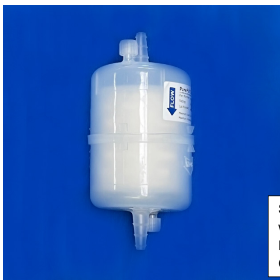
SKL Series Capsule with 1/4"-3/8" Tapered Hose Barb Inlet and Outlet Connection