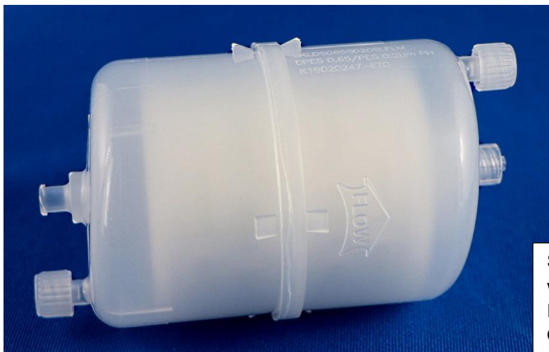
SKL Series Capsule with Luer Loc Female Inlet and Luer Loc Male Outlet Connection

11070 Fleetwood St. Unit B, Sun Valley, CA 91352