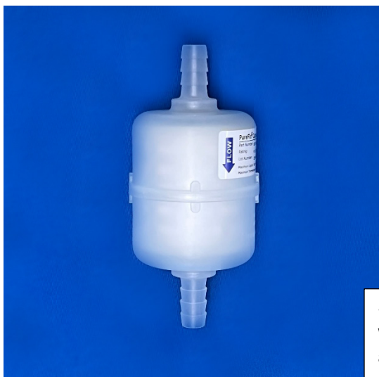
SKL Series Capsule with 1/2" Hose Barb Inlet and Outlet Connection