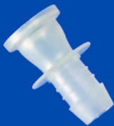
Mini Tri-Clamp Series