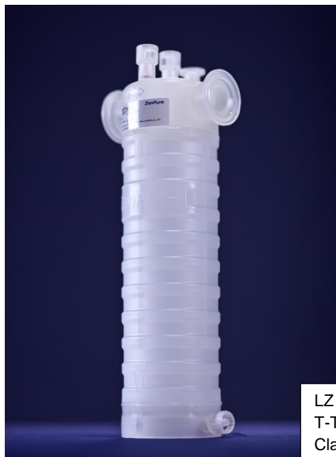
LZ Series [Nominal 10-in Long], T-Type Capsule with 1.5" Tri-Clamp Inlet and Outlet Connection