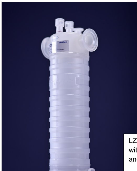
LZ Series T-Type Capsule with 1.5" Tri-Clamp Inlet and Outlet Connection