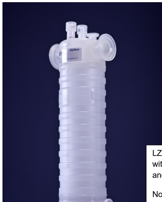
LZ Series T-Type Capsule with 1.5" Tri-Clamp Inlet and Outlet Connection Nominal 10-Inch Capsule