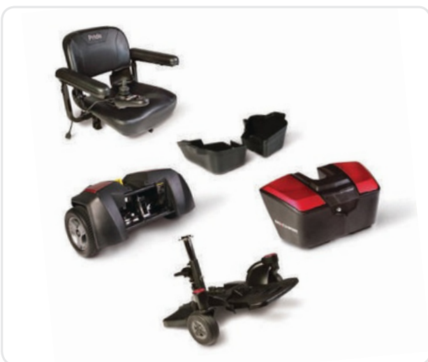
One-hand "Feather Touch" disassembly

The all-new Go Chair® is re-engineered from the ground up, offering a bold style available in an array of contemporary colours. Enhanced performance and comfort, along with feather-touch disassembly, allows you to enjoy lightweight travel and independence on the go. With an increased weight capacity of 136 kgs (300 lbs.) and a sleek, bold look, the Go Chair® makes travel easy.