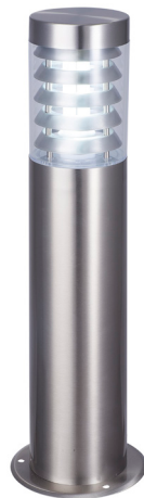
CLA1615S (Bollard Light)