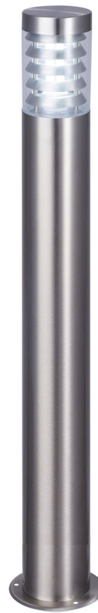
CLA1615L (Bollard Light)