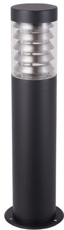
CLA1615SBL (Bollard Light)