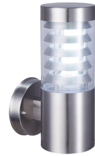
CLAW32 (Wall Light)