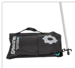
Shown with H2Pro Weight Bag #HP-WB1