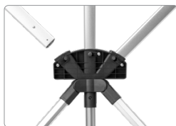
Step 2, Upper Section