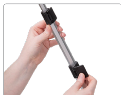
Step 3, Upper Section