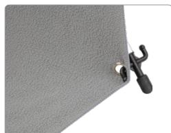
Step 7, Upper Section