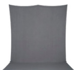
Backdrop Sizes & Colors Vary, Included in Kits & Sold Separately