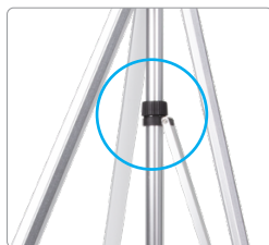
Step 1, Reducing Footprint