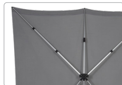
Step 6, Upper Section