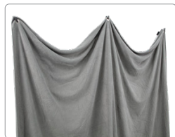
Step 5, Upper Section