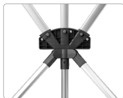
Step 2, Upper Section