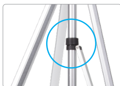
Step 1, Lower Section