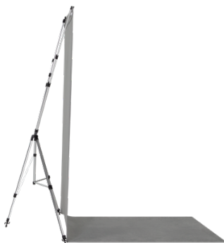
Rear Leg Partially Extended