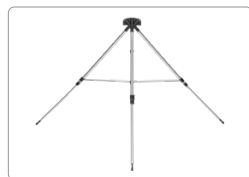
Step 3, Lower Section