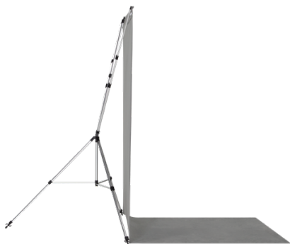
Rear Leg Fully Extended