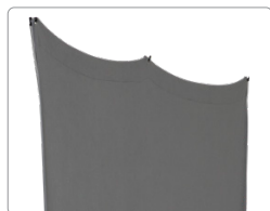
Step 6, Upper Section