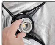
Shown using square softbox