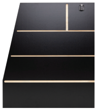
Left Side Panel