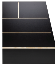
Right Side Panel