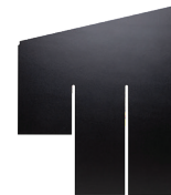
Top Divider (x2)