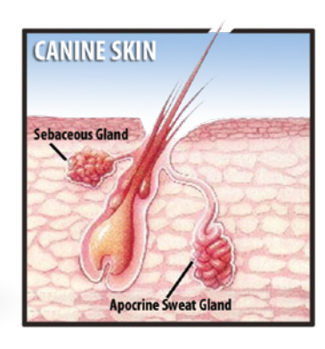
Epidermal Thickness: 3-5 Layers Epidermal pH: 7.5