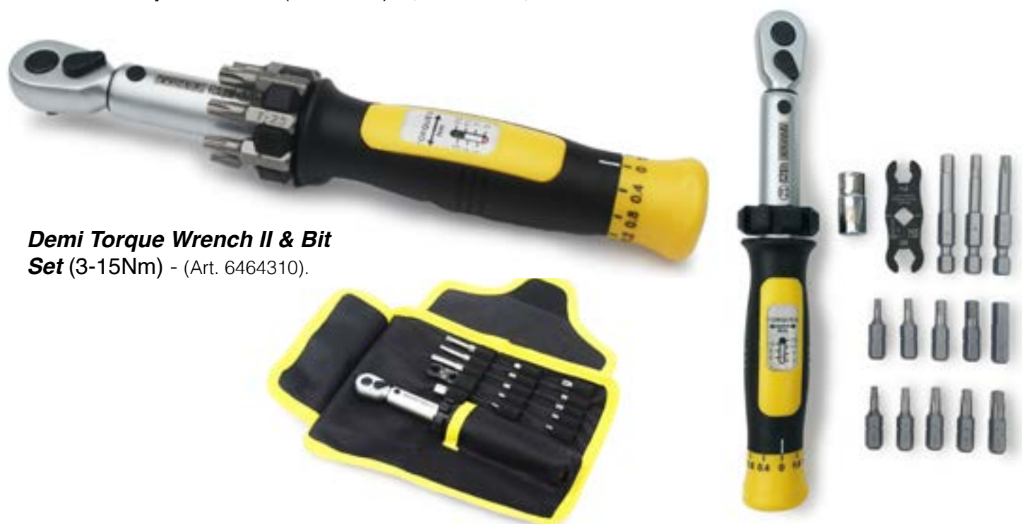
Demi Torque Wrench II & Bit Set (3-15Nm) - (Art. 6464310).