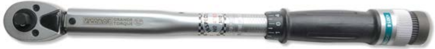
Grande Torque Wrench (10-80Nm) - (Art. 6464310).