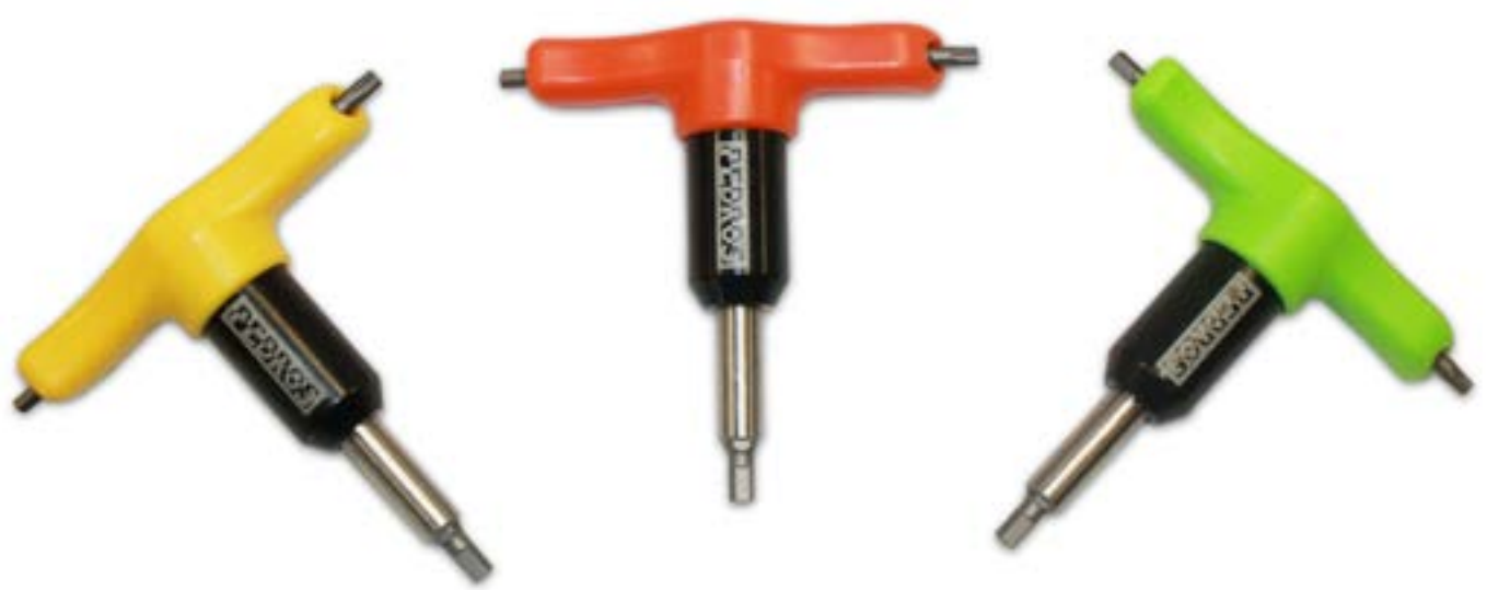
Fixed Torque Drive - 4Nm , yellow - (Art. 6464310).