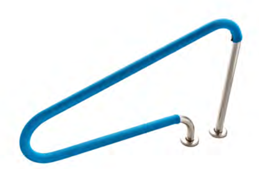
Shown as Teal. Tan and Blue