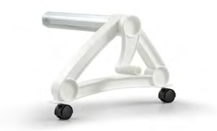
Item # FG-BH - Ends Carton