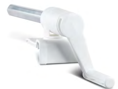
Item # FG-SRE - Ends Carton