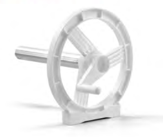
Item # FG-1B - Ends Carton