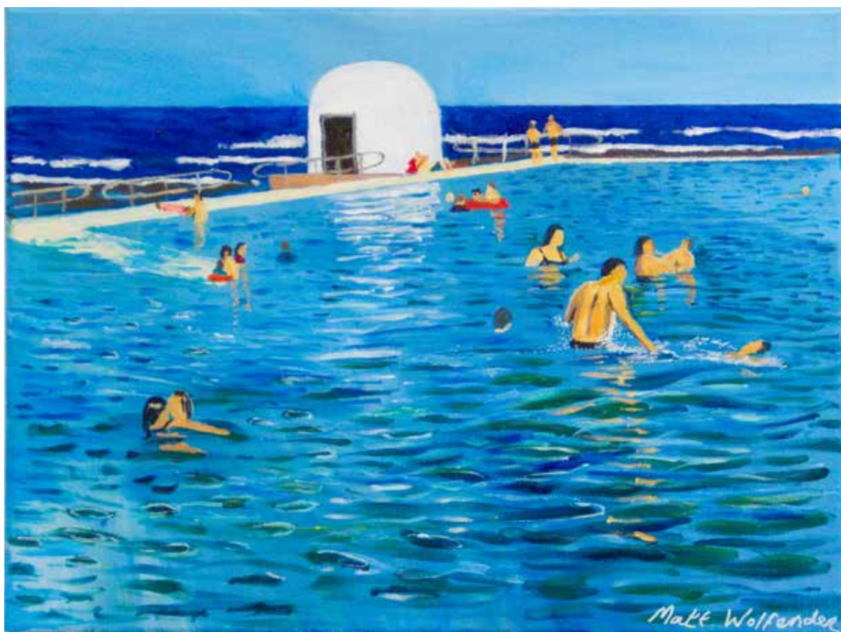
PEOPLE PLAYING ACRYLIC ON CANVAS 40 X 50 CM $180