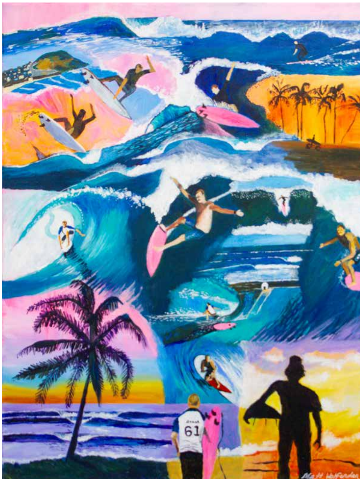
PORTRAIT OF JACKSON BAKER ACRYLIC ON CANVAS 100 X 75 CM $750