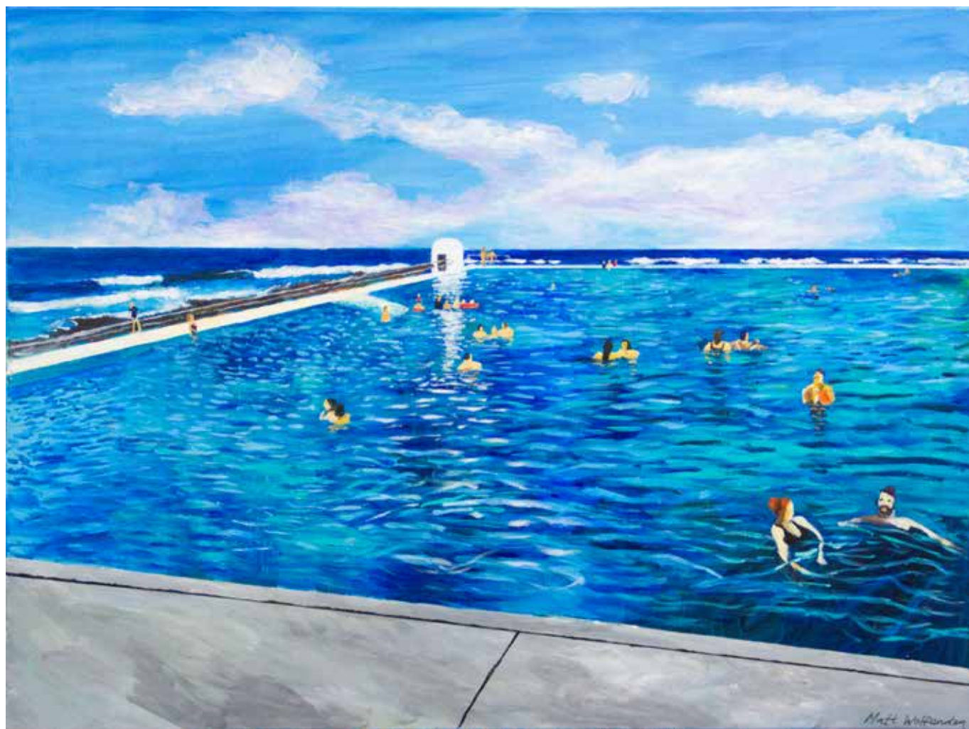
MEREWETHER MORNING ACRYLIC ON CANVAS 75 X 100 CM $750