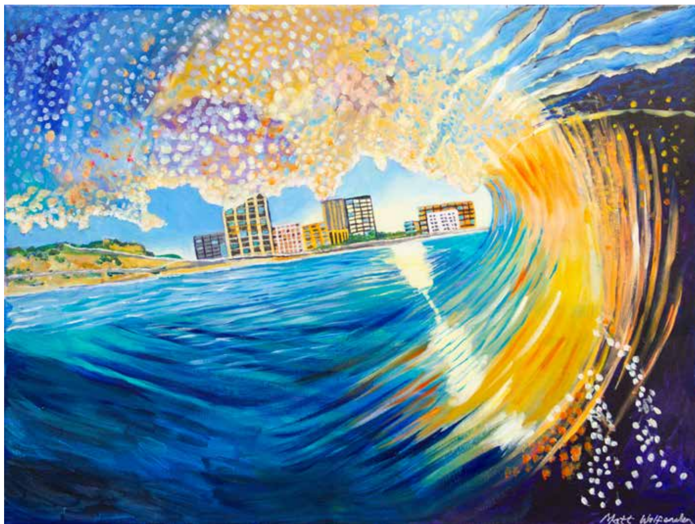
SURF CITY ACRYLIC ON CANVAS 75 X 100 CM $750