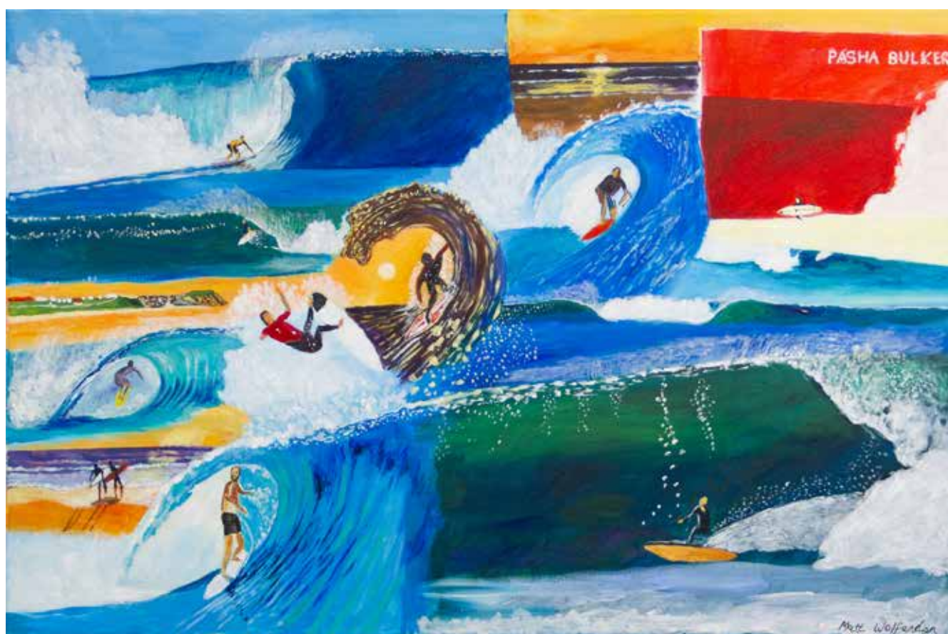
PORTRAIT OF RHYS SMITH ACRYLIC ON CANVAS 60 X 90 CM $550