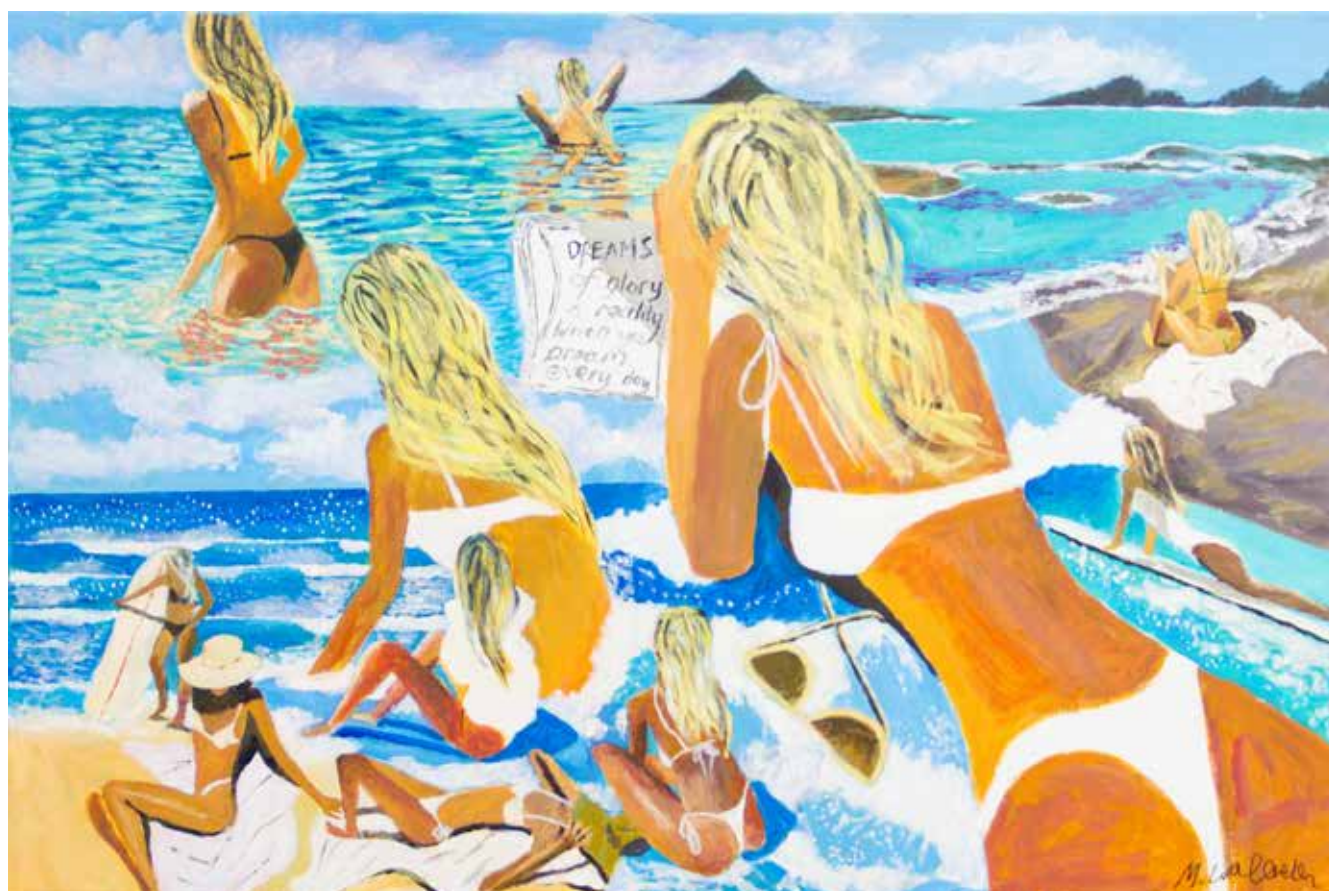
DAY AT THE BEACH ACRYLIC ON CANVAS 60 X 90 CM $450