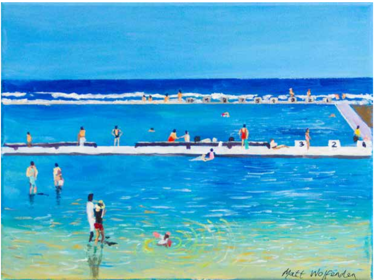
AFTERNOON BATHS ACRYLIC ON CANVAS 40 X 50 CM $180