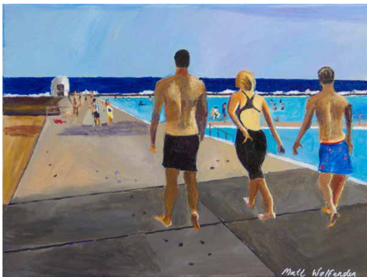
THREE FIGURES WALKING ACRYLIC ON CANVAS 40 X 50 CM $180