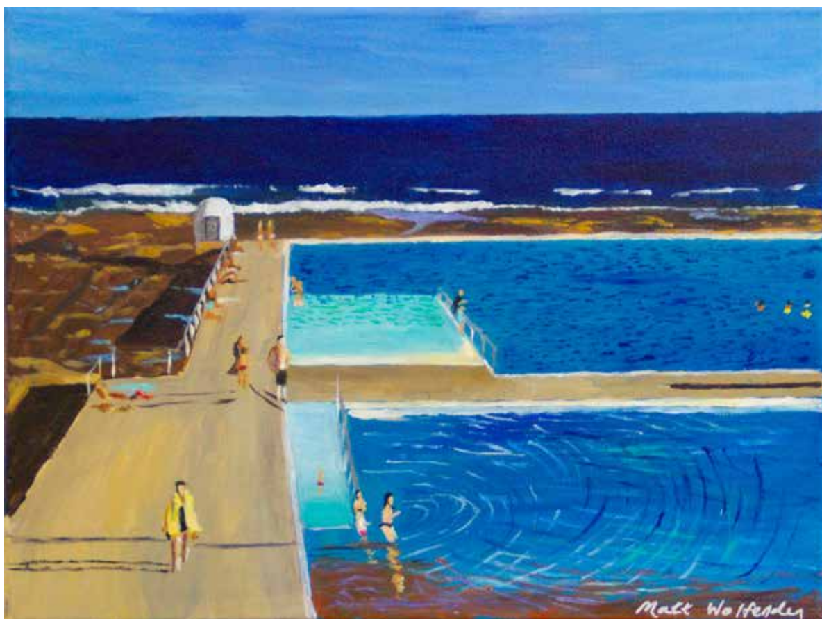
MORNING BATHS ACRYLIC ON CANVAS 40 X 50 CM $180