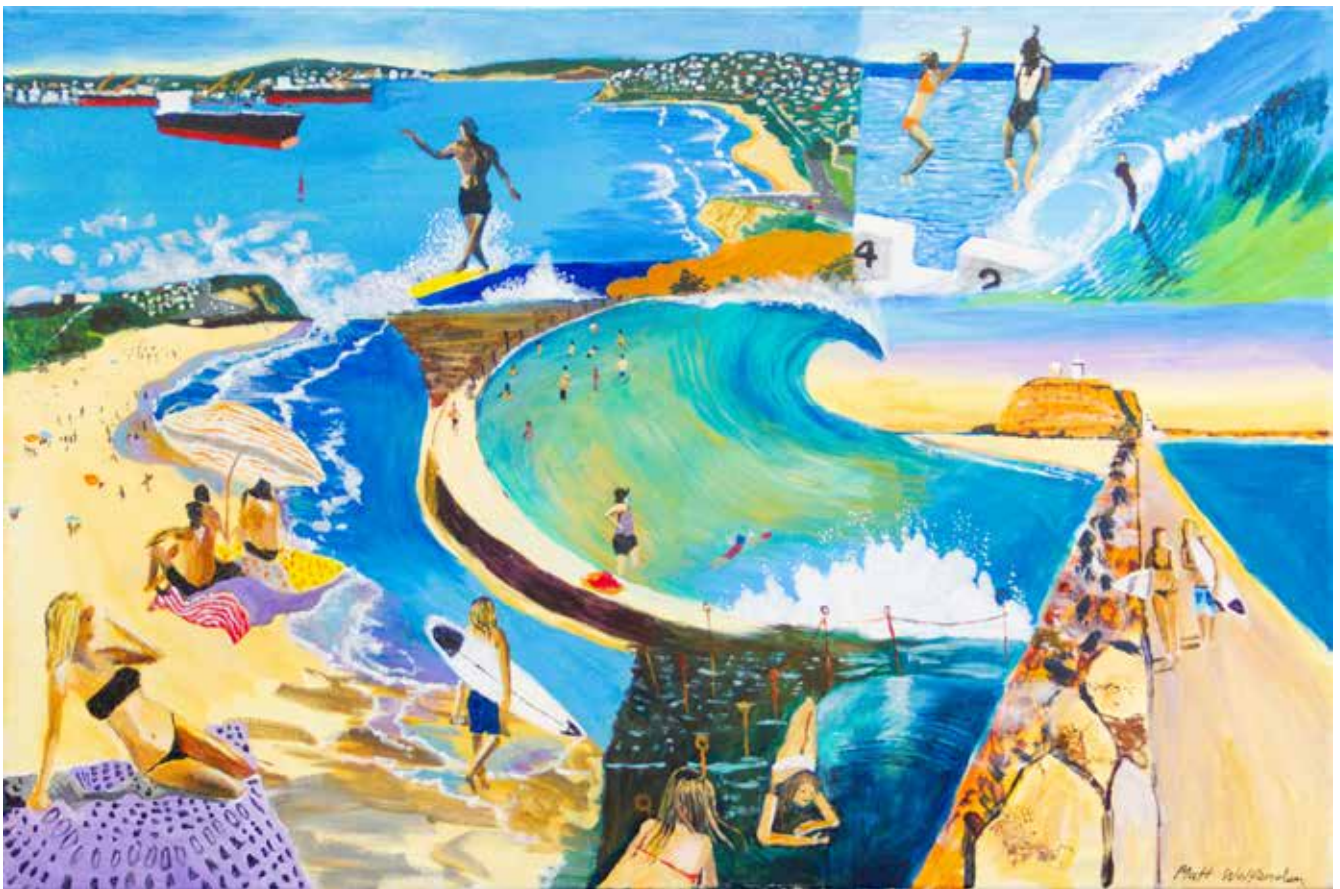
NEWCASTLE WORLD POOL ACRYLIC ON CANVAS 60 X 90 CM $450