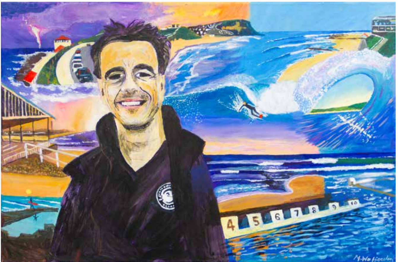
AURA OF GARRY CALLINAN ACRYLIC ON CANVAS 60 X 90 CM $550