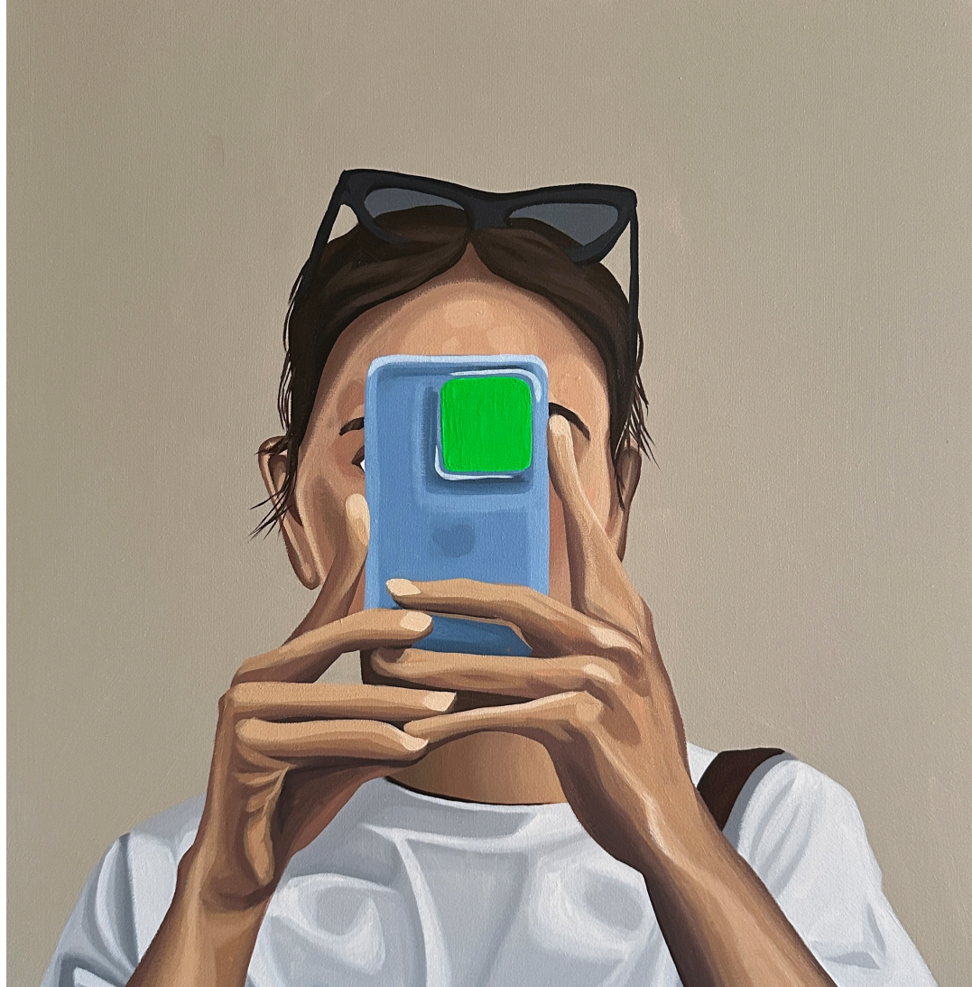
'Narcissus', 2024 Acrylic on Canvas 50 x 45 $500