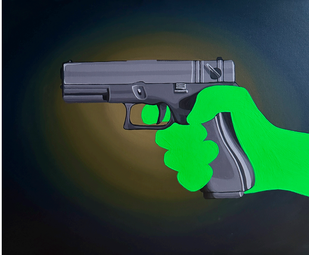
'Xiphos', 2024 Acrylic on Canvas 60 x 50 $550