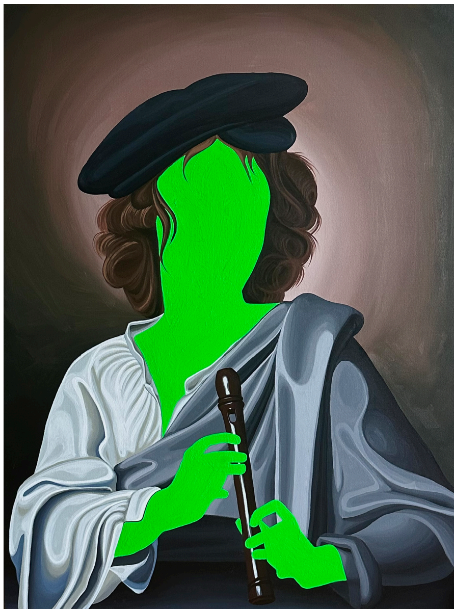
'The Piper', 2024 Acrylic on Canvas 105 x 80 $2000