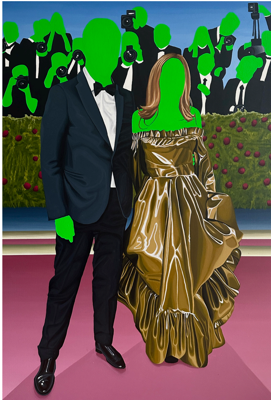
'Oedipus at Colonus', 2024 Acrylic on Canvas 150 x 100 $3000