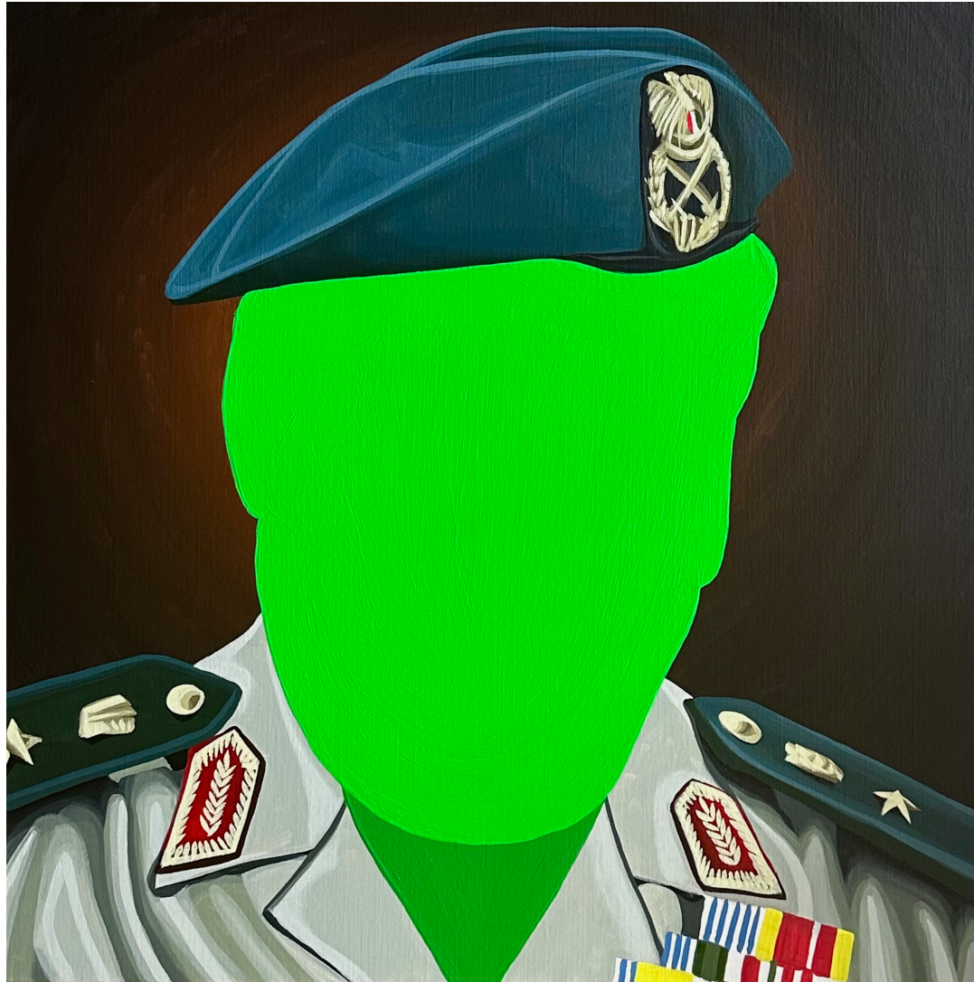
'Vercingetorix', 2024 Acrylic on Canvas 50 x 50 $500