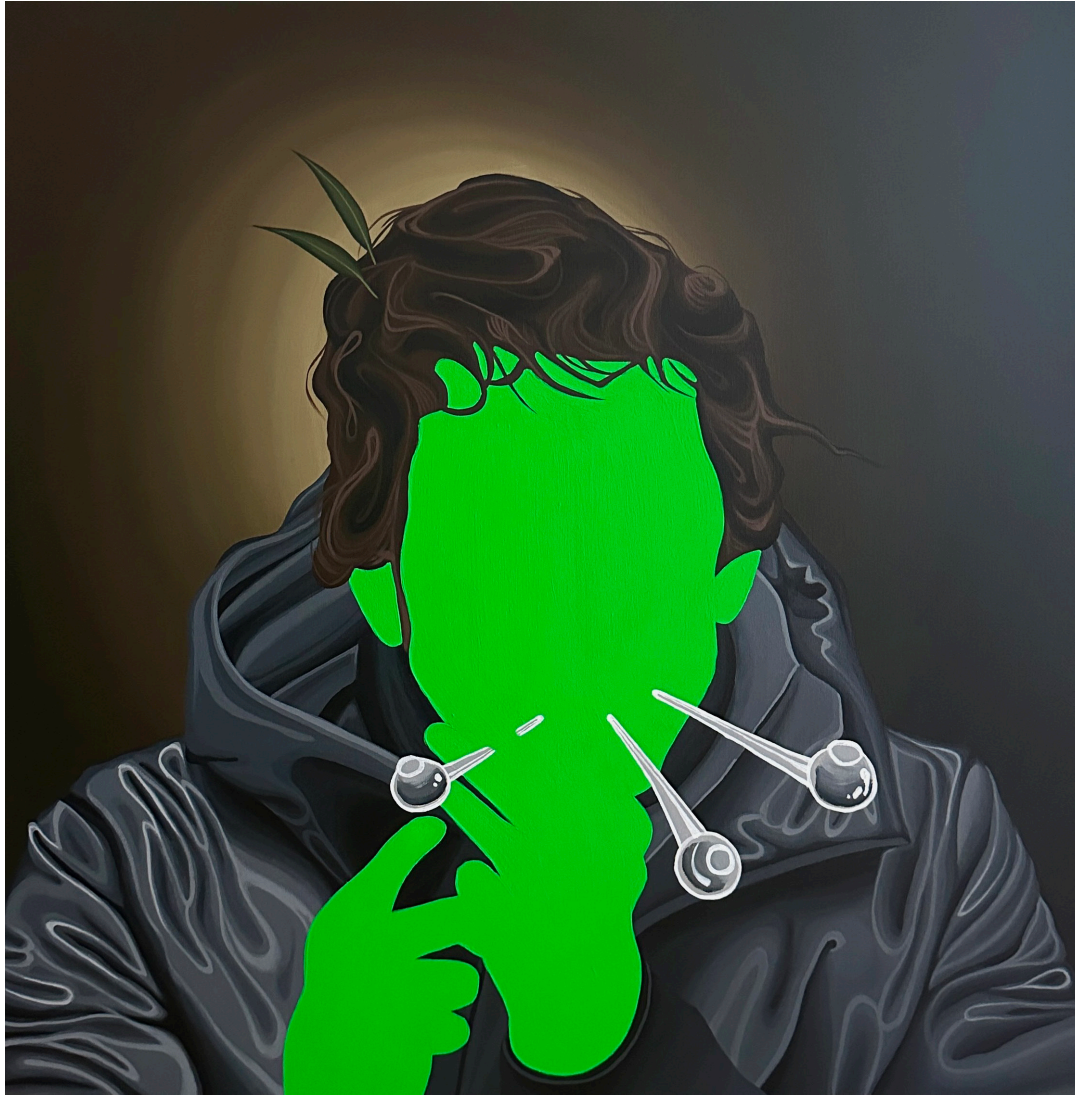
'Bacchus', 2024 Acrylic on Canvas 110 x 90 $2000