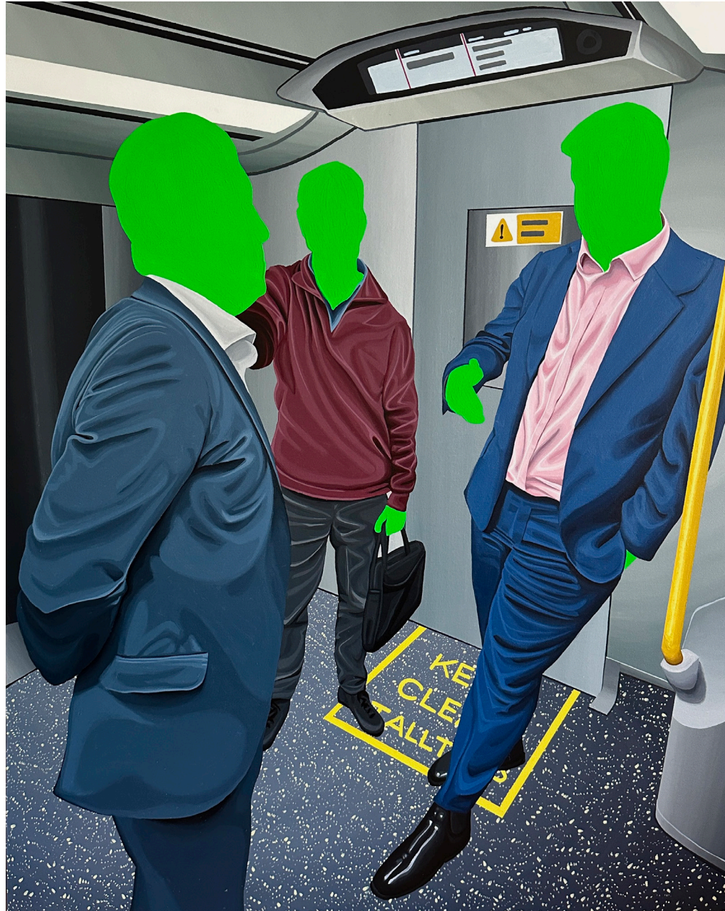
'The Serfs', 2024 Acrylic on Canvas 150 x 120 $3500