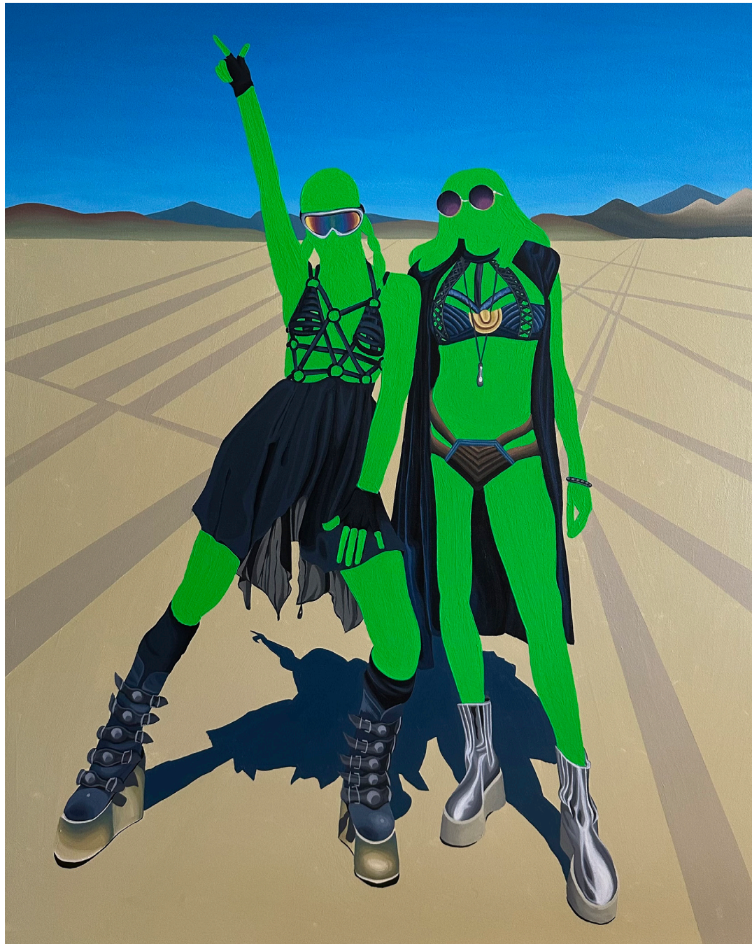
'The Muses', 2023 Acrylic on Canvas 150 x 120 $3500