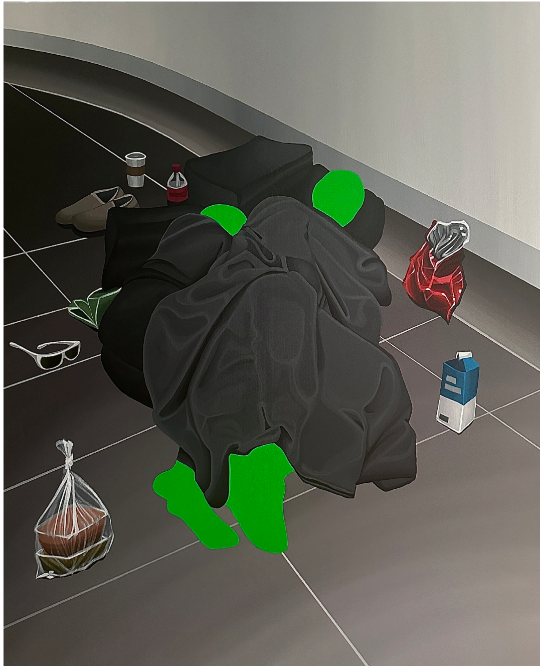
'Crates & Hipparchia', 2024 Acrylic on Canvas 120 x 100 $2000