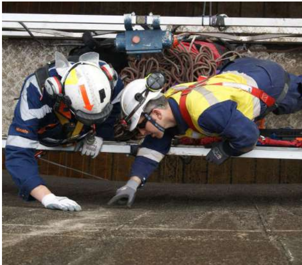
Specialist Access & Remedial Engineering