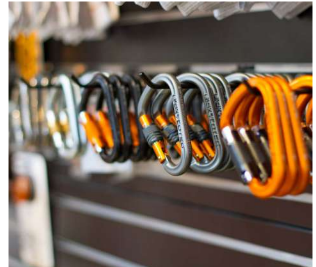
Specialist Safety Equipment