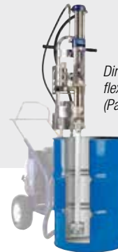
Direct Immersion Kit allows ultimate flexibility with tough-to-spray materials. (Part #287843)