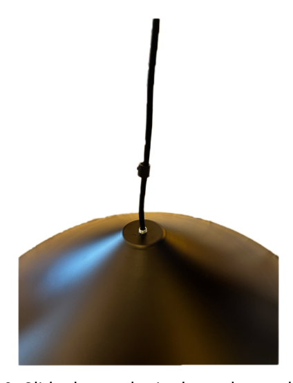
2. Slide the cord grip down the cord.