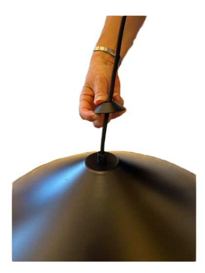
4. Slide the conical top down the cord so it covers the cord grip.