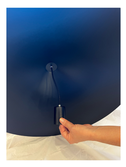
1. Remove the cord grip from the fitting and thread the cord through the hole in the shade from underneath

Only to be connected to an electrical supply by a registered electrician