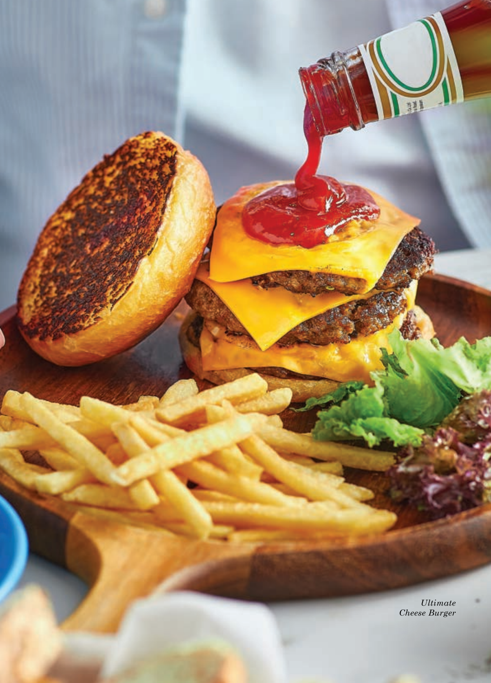
Ultimate Cheese Burger