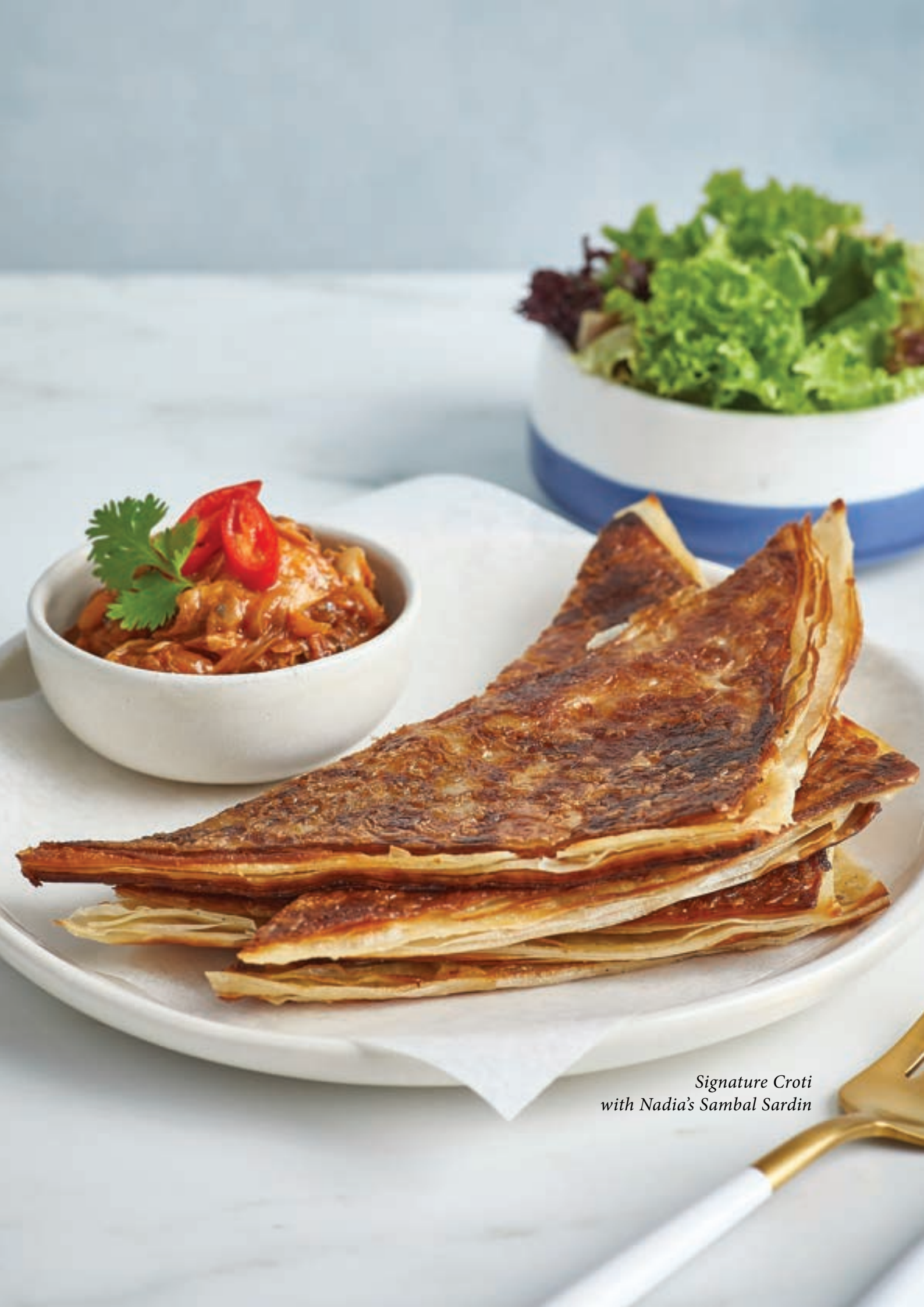
Signature Crosti with Nadia's Sambal Sardin