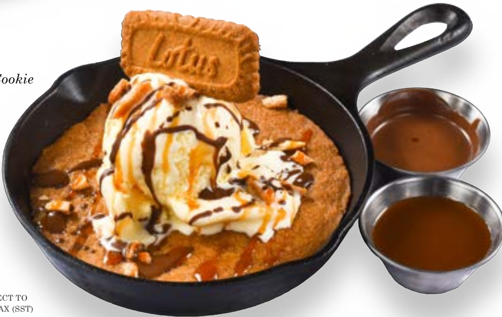
Speculoos Skillet Cookie

Please browse our Pastry Counter for today's selection of freshly baked treats!