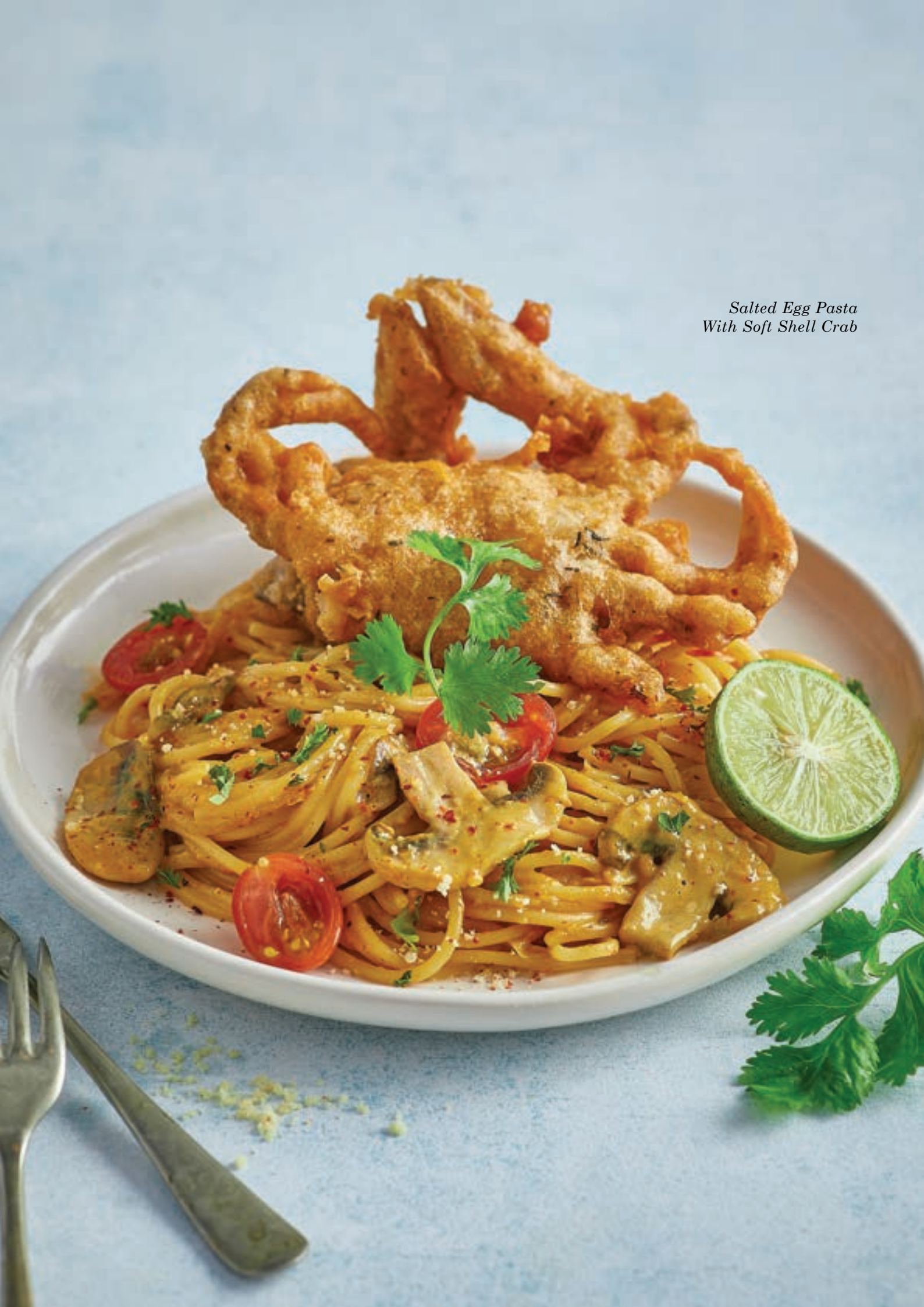
Salted Egg Pasta With Soft Shell Crab