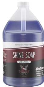
Shine Soap: Waxes & Sealants