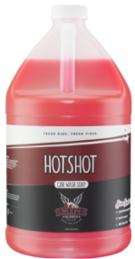
Hotshot Soap: General Washing

Soap to use depending on what protection the vehicle has: