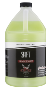
Shift Soap: Ceramic Coatings, Vinyl and PPF