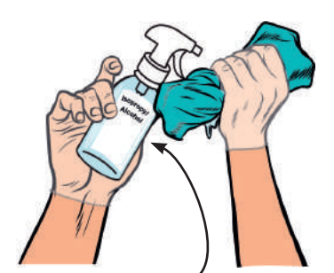
Remove with any standard cloth & Isopropyl alcohol