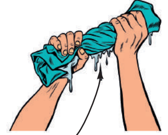
Remove with any standard wet cloth