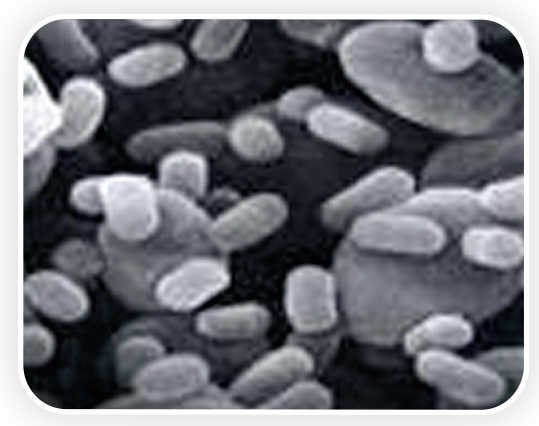
Gedek, BR. Adherence of Escherichia coli serogroup O 157 and the Salmonella typhimurium mutant DT 104 to the surface of Saccharomyces boulardii. Mycoses. 1999; 42(4):261-264

Saccharomyces boulardii is a probiotic, health-promoting yeast with remarkable attributes. S. boulardii has been shown to restore healthy microbial balance by competing against harmful bacteria and creating an environment that favors the growth of resident lactic acid microflora.<sup>1</sup> Pathogen adherent microflora (PAMs) are probiotics that bind and eliminate pathogens during normal probiotic transit.<sup>2</sup> S. boulardii is an ideal PAM because it attracts pathogens to the mannose component of its cell wall. Research has proven this mechanism binds pathogenic bacteria preventing adhesion of these pathogens to the intestinal cells.<sup>3</sup> In addition, because it is a probiotic yeast, S. boulardii is not susceptible to antibiotics, making it a great addition to any multi-strain probiotic combination.