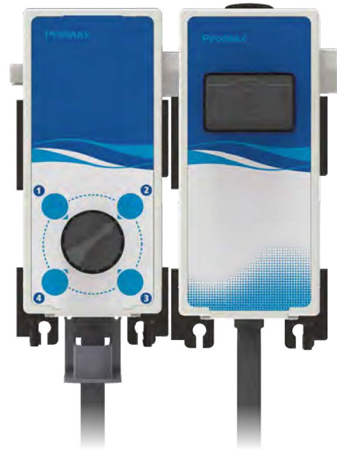
ProMax Slide 4 Product & Button 1 Product