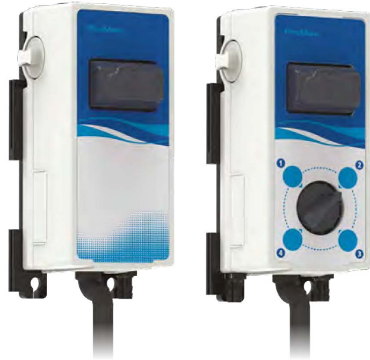
ProMax Button 1 Product

By combining the revolutionary technology of patented hydrodynamics and user friendly, image enhancing features unique to ProMax, SEKO has produced the perfect solution for all institutional and light industrial chemical dilution applications.