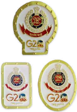
LAPEL PIN/ BROOCH PIN