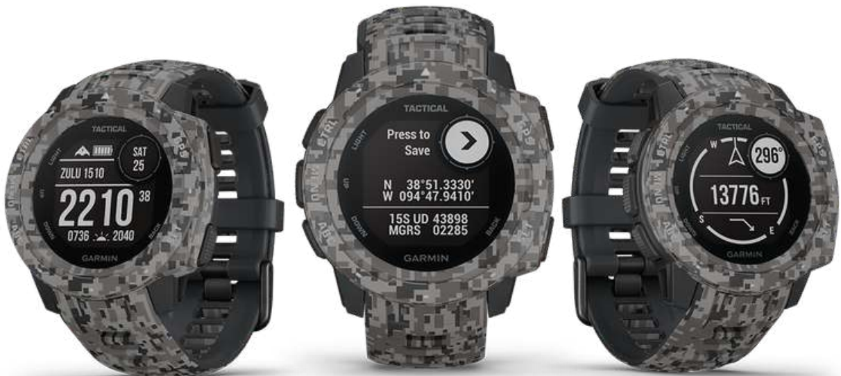
GARMIN INSTINCT TACTICAL EDITION