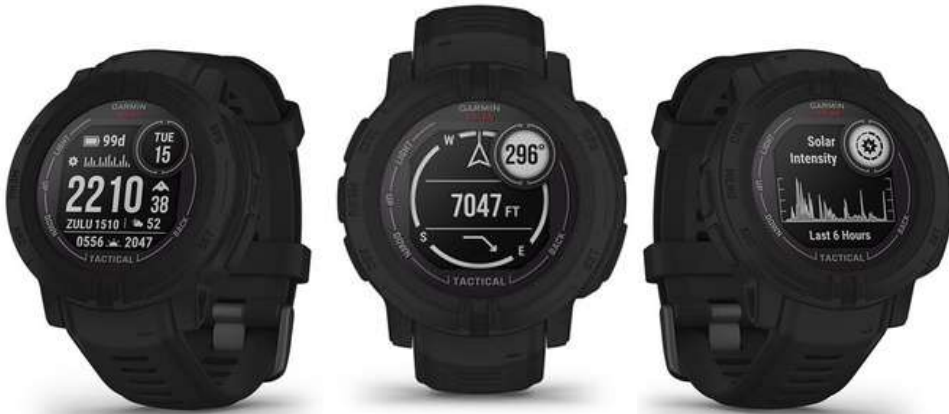
GARMIN INSTINCT 2 SOLAR TACTICAL EDITION