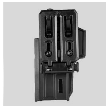
2-IN-1 BELT CLIP