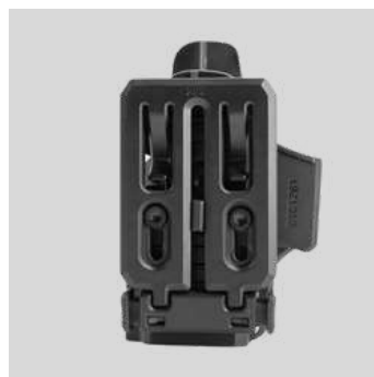
2-IN-1 BELT CLIP