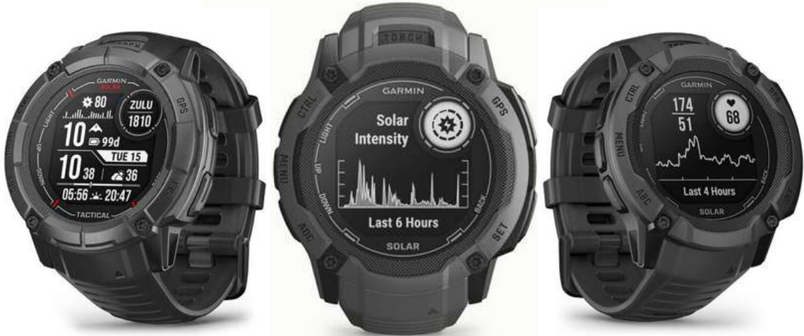
INSTINCT 2X SOLAR - TACTICAL EDITION