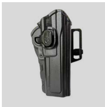
2-IN-1 BELT CLIP