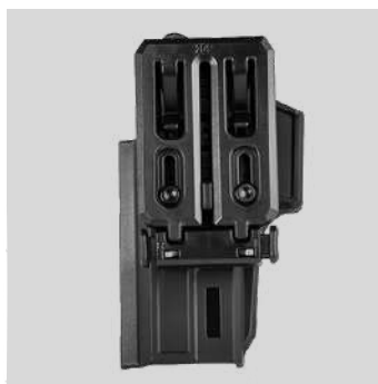
2-IN-1 BELT CLIP