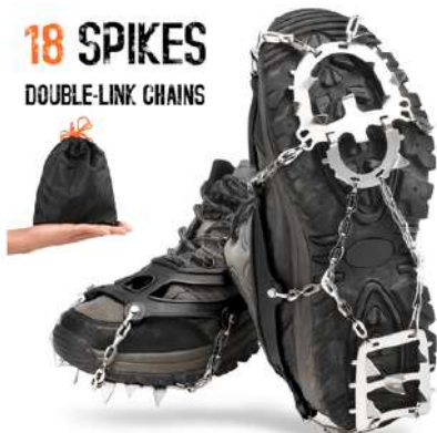
18 SPIKES DOUBLE-LINK CHAINS