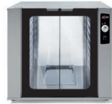
AX-PR8 SHIP WT: 233 lbs