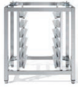
AX-801 Oven Stand SHIP WT: 54 lbs