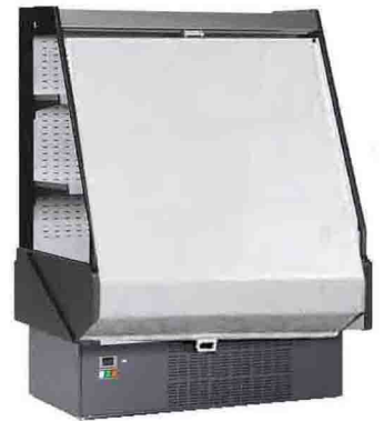
PULL DOWN NIGHT CURTAIN STANDARD