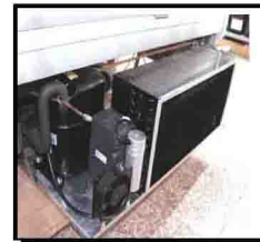
PULL OUT CONDENSING UNIT ON SELF CONTAINED