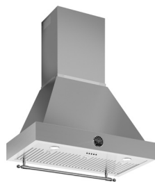
K36HERTX + KC36HERTX Stainless steel canopy