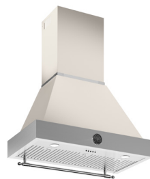
K36HERTX + KC36HERTAV Ivory gloss canopy