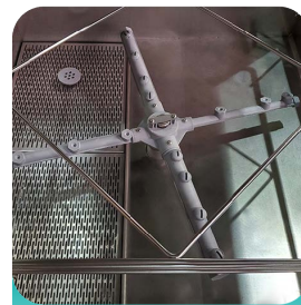
INNER STAINLESS STEEL WASH TANK