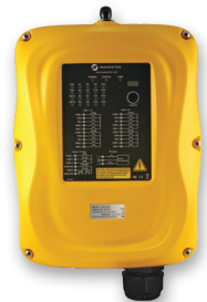
Flex Wave 8/12 Receiver 260 x 204 mm