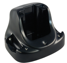
Charging Cradle Available for Easy Recharge