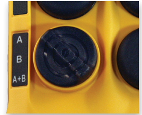
Selector Switch Available on A/B Models

A three-position selector switch allows one operator to switch operation between two trolley/hoists (A, B, or Both) that are located on a single bridge. The operator can easily identify which trolley hoist is active on the crane by the position of the selector switch (Available on 8- and 12-button models).