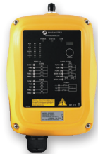
Flex Wave 4/6 Receiver 196 x 149 mm