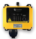
MRX Receiver 120 x 90 mm